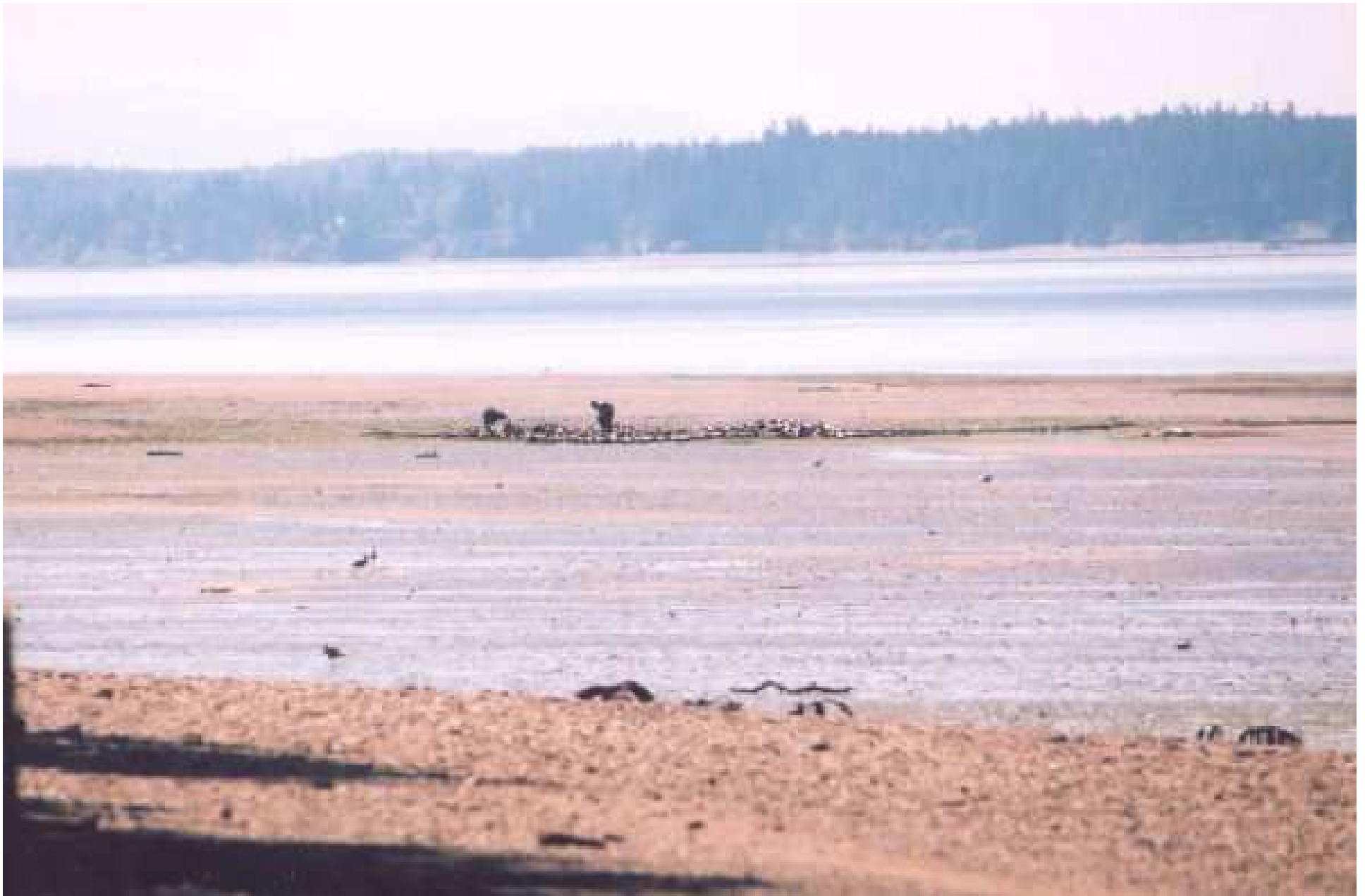
Taylor Foss geoduck operation – pulling tubes, 2007