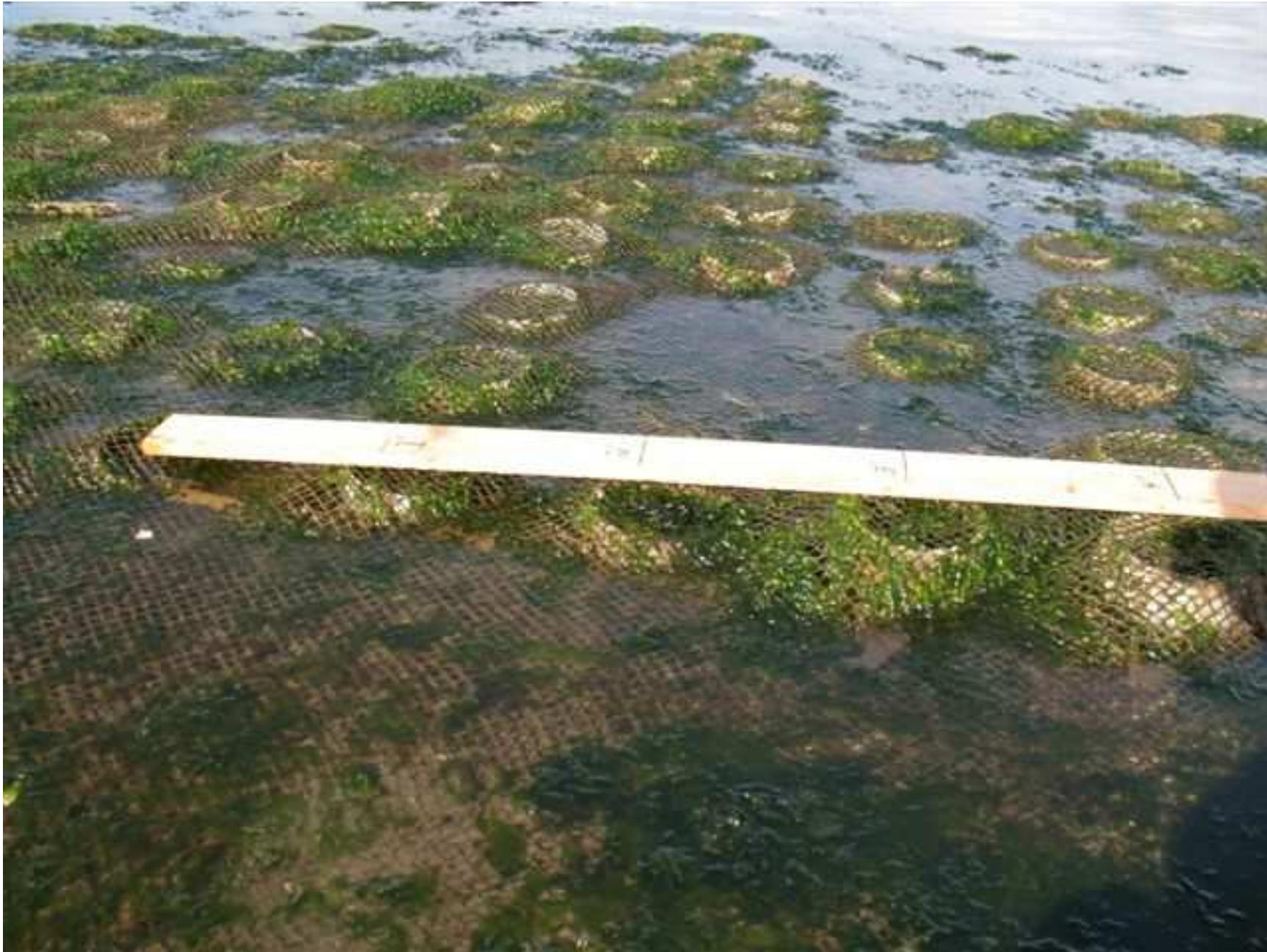
Density of tubes that did not escape under net, 6/11/07