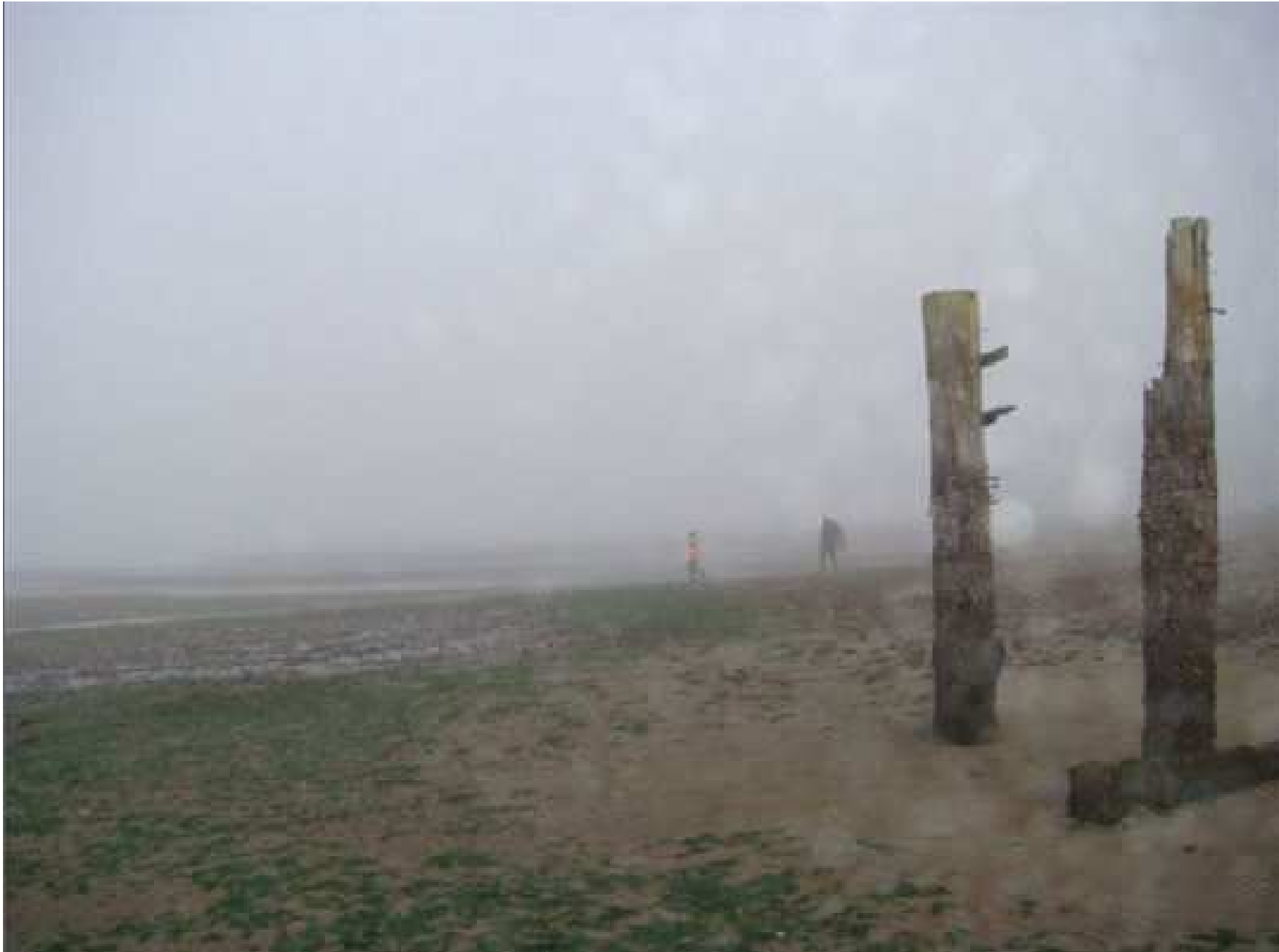
Taylor Foss geoduck operation – geoducks planted close to pilings, high up on the beach, 10/23/07