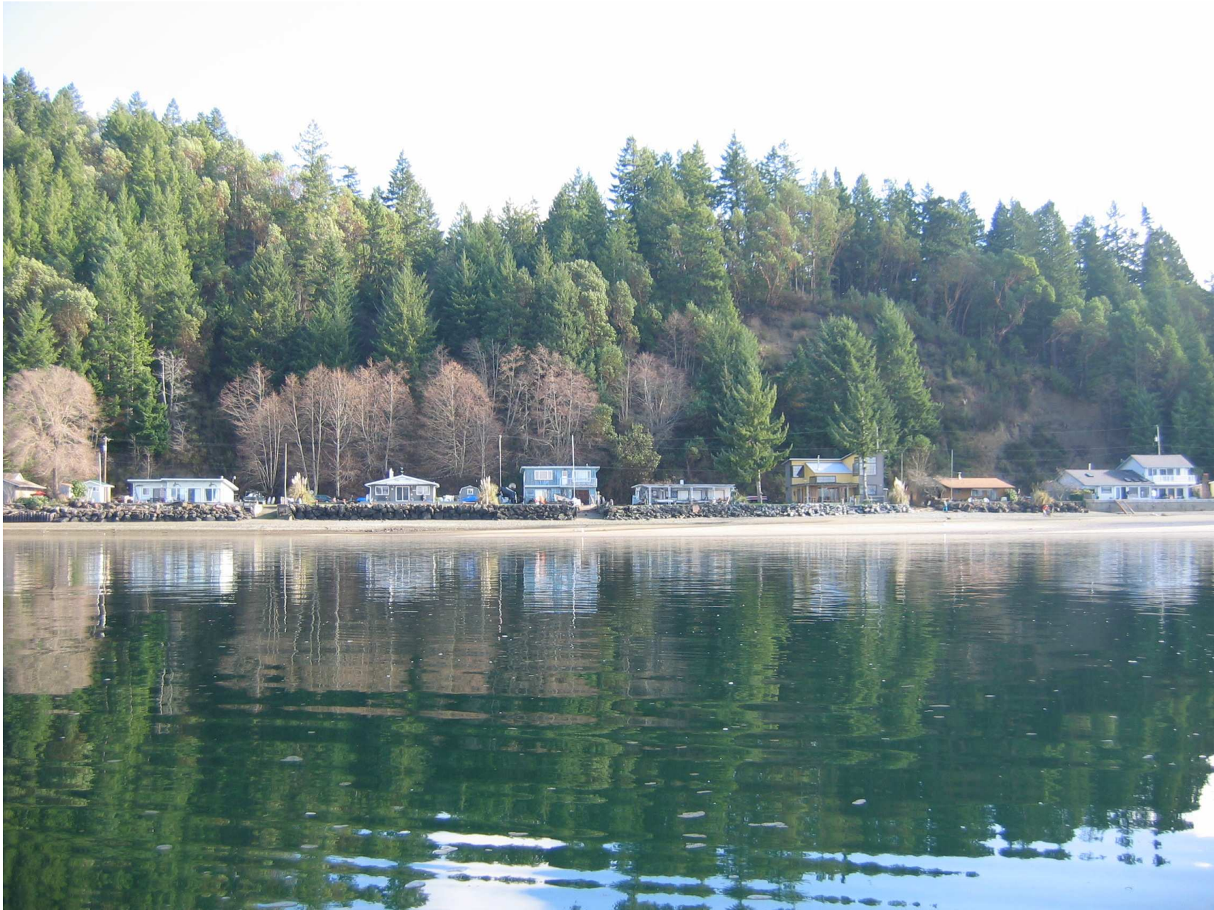
Community just north of Foss Geoduck operation. Trash from farms continually being picked up from this area.