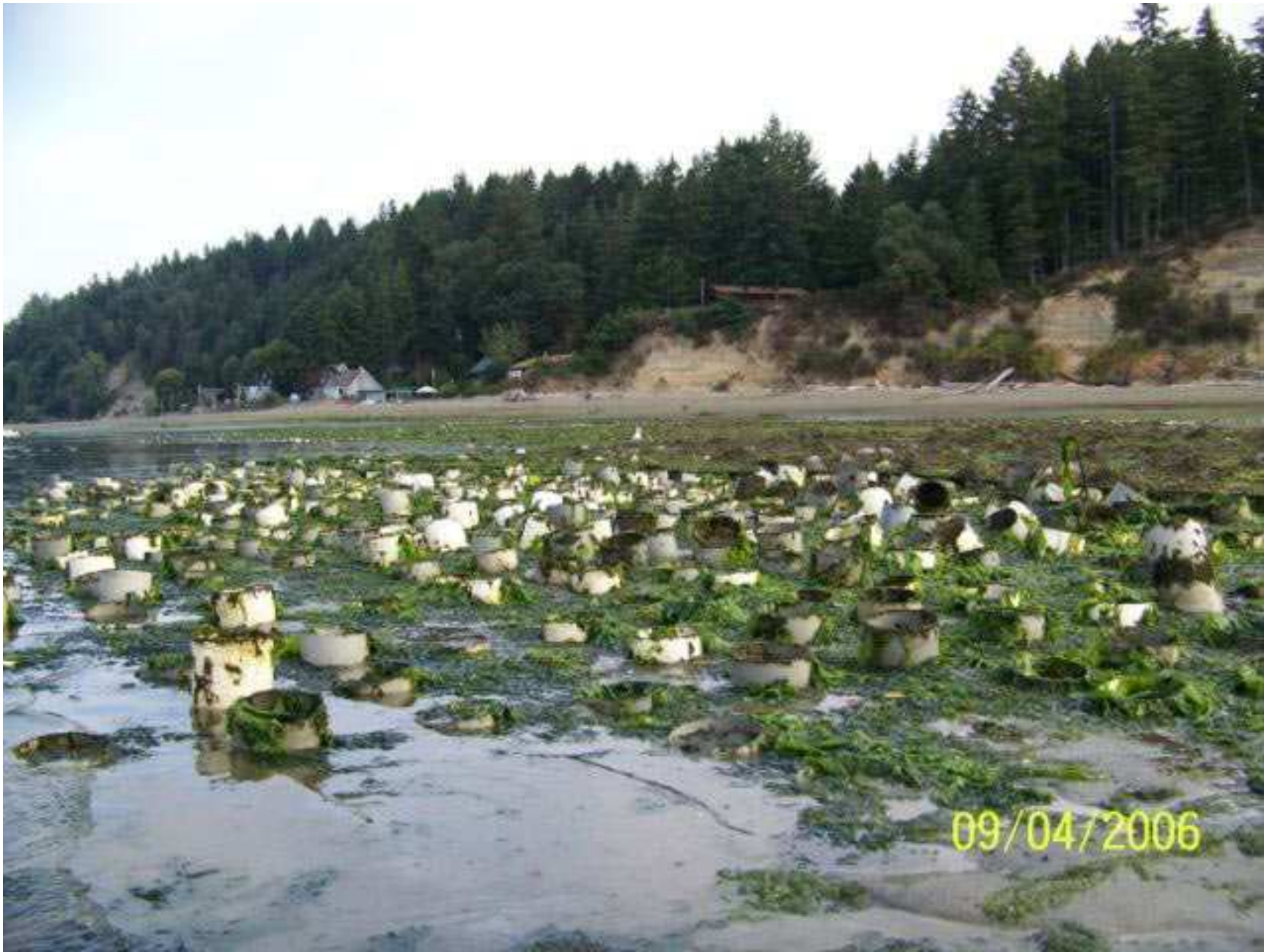
Taylor Foss geoduck operation, 9/4/06