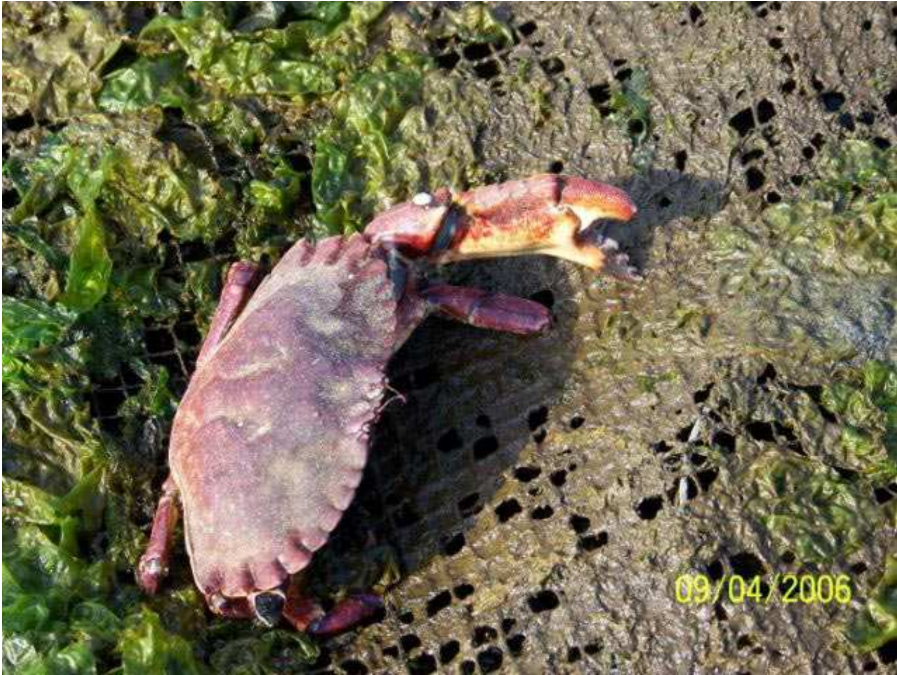
'Predator Exclusion' netting – Taylor Foss operation, 9/4/06