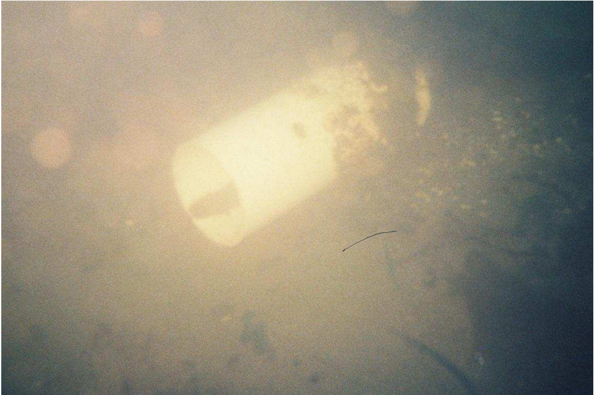
Taylor Shellfish Foss farm debris in deeper water, seen by diver, 5/07