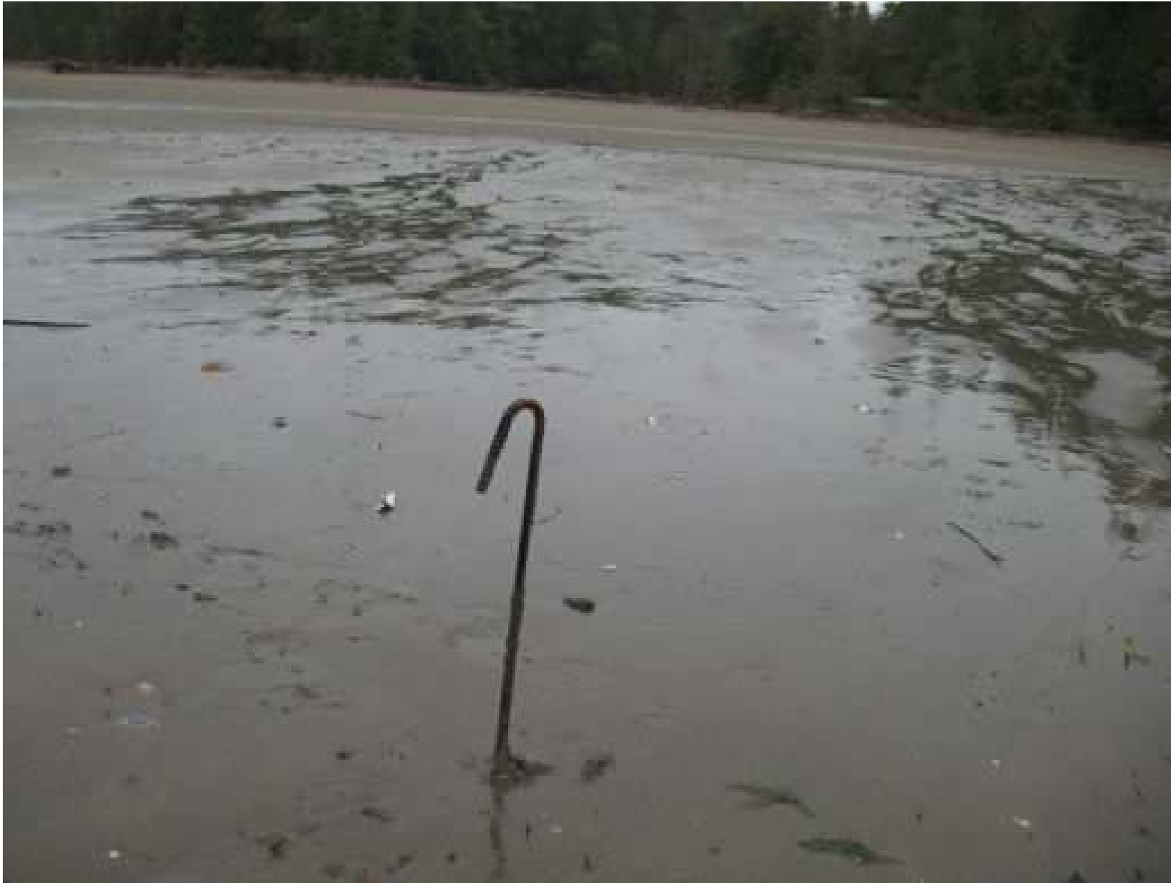
Taylor Foss operation, rebar hazard, 03/07