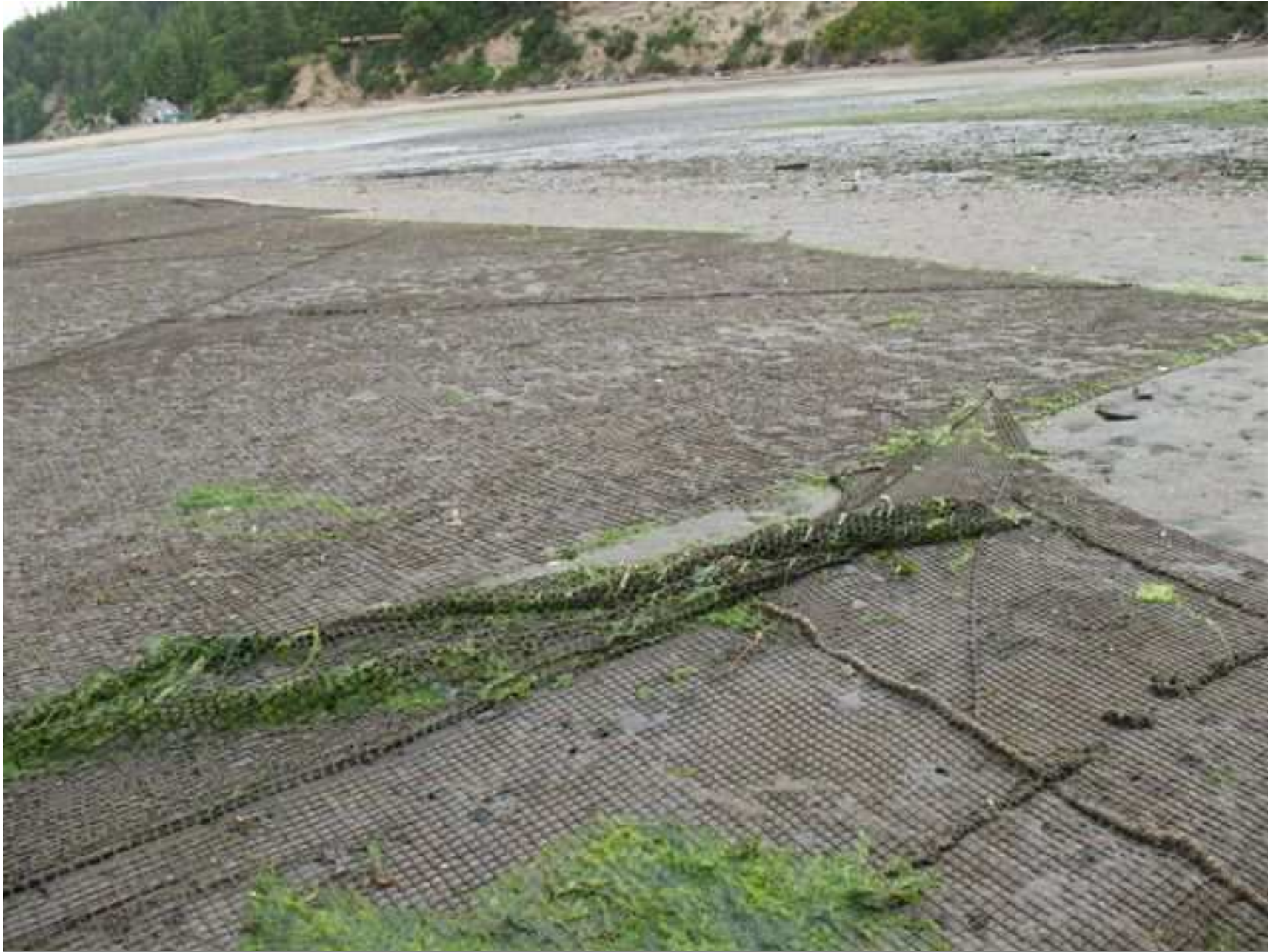
Taylor Foss operation, loose netting, 6/11/07