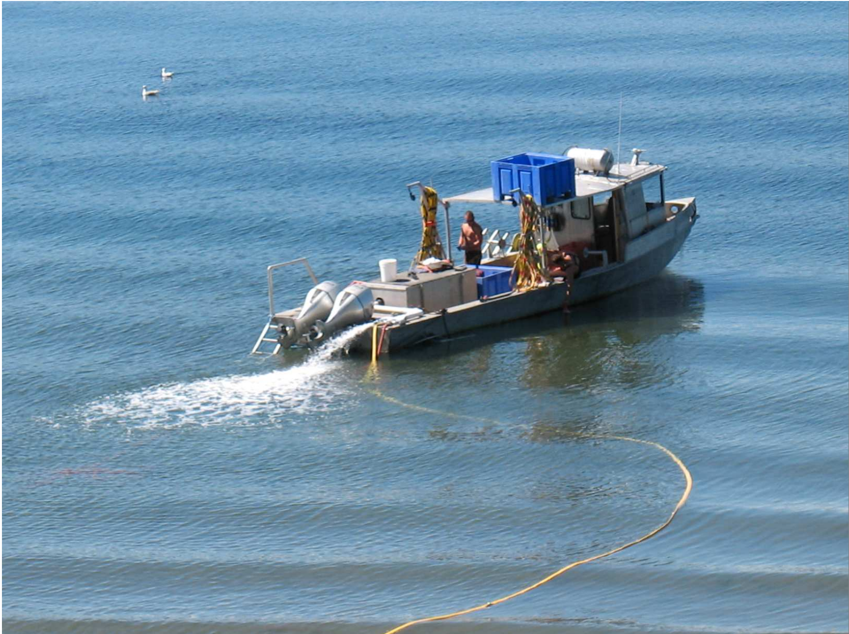
Taylor Foss operation 8/14/07