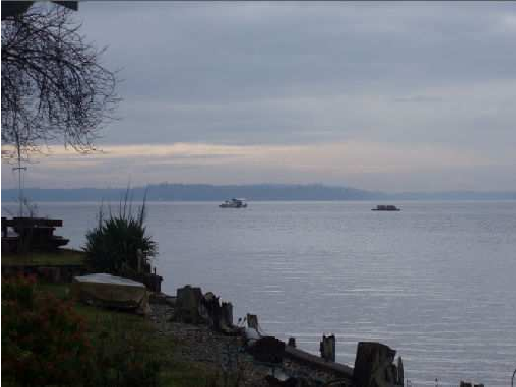
Taylor Shellfish Foss operation barge and commercial traffic, 2/8/07