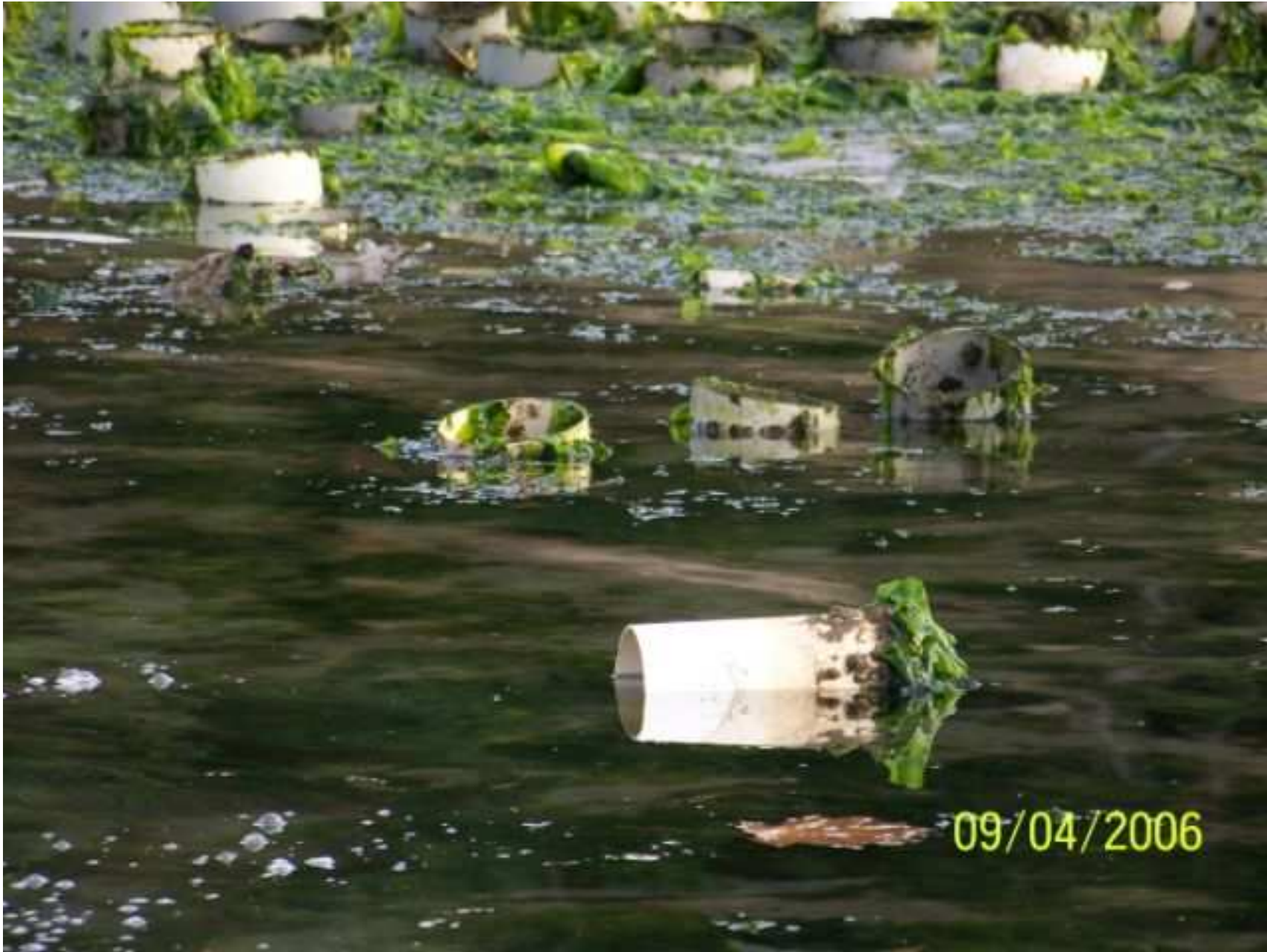
Loose tubes on Foss geoduck farm, 9/4/06