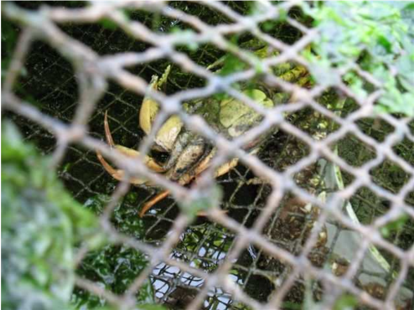
Taylor Foss operation, double netting traps crab, 6/11/07