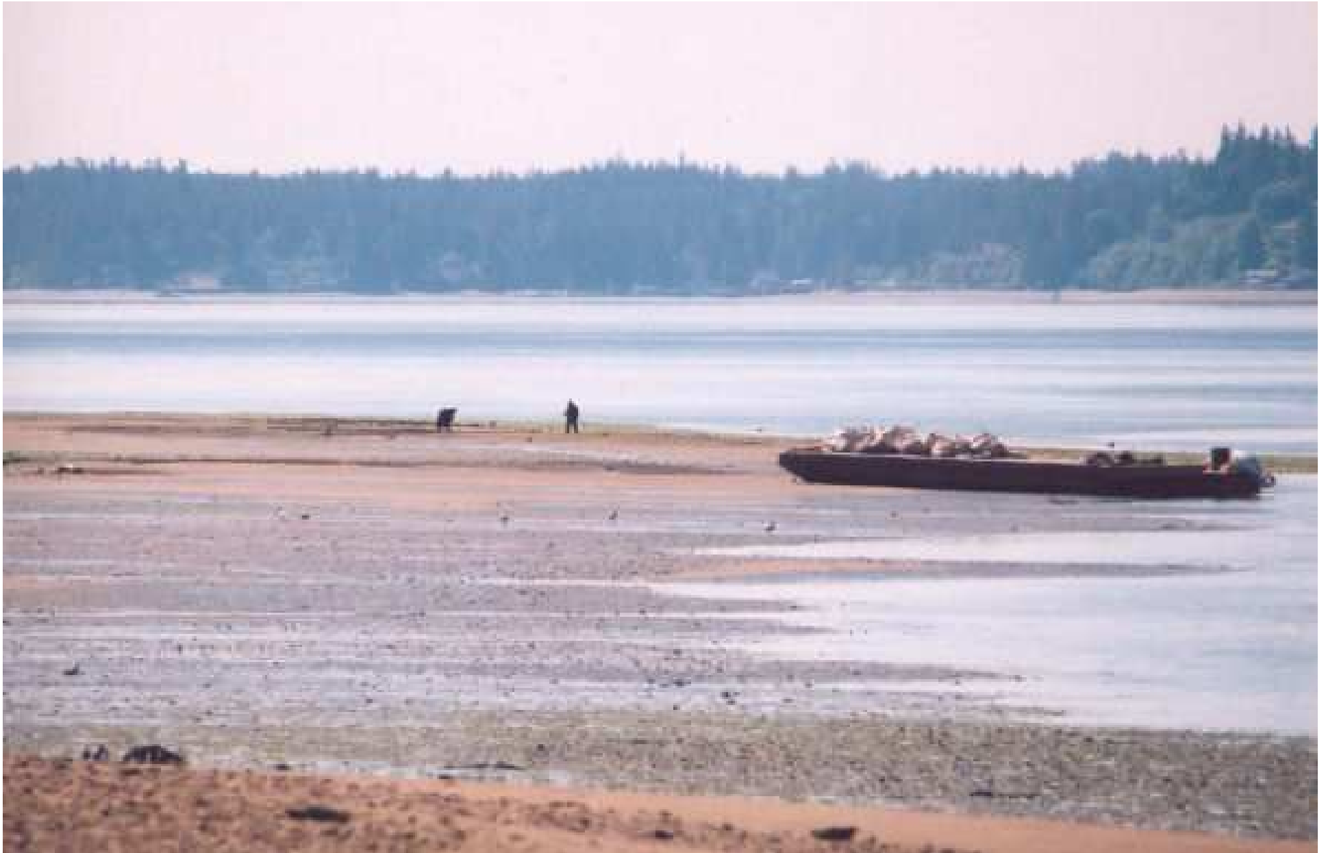
Taylor Foss geoduck operation – tube barge and workers, 2007