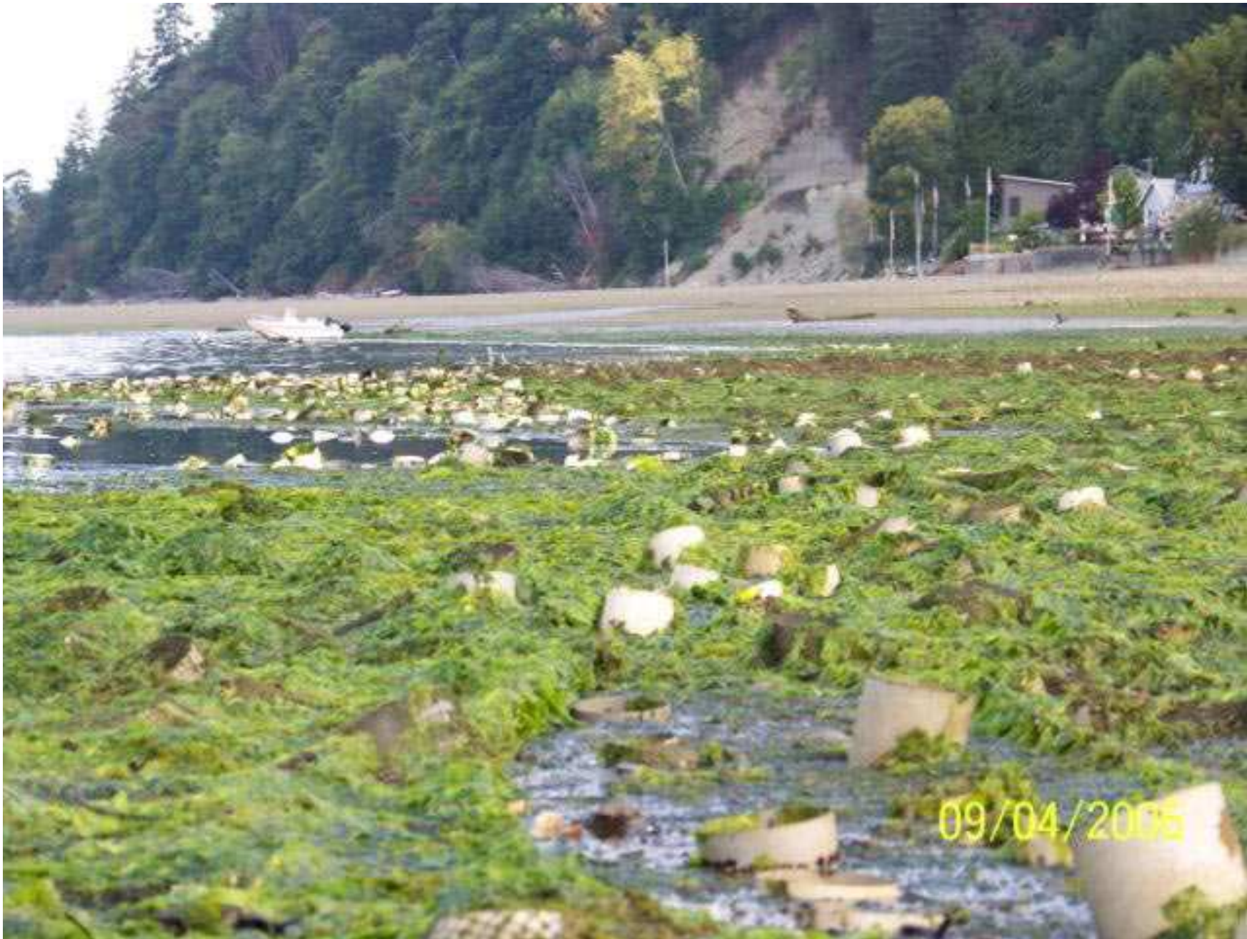
Accumulation of macro algae on Foss geoduck farm.