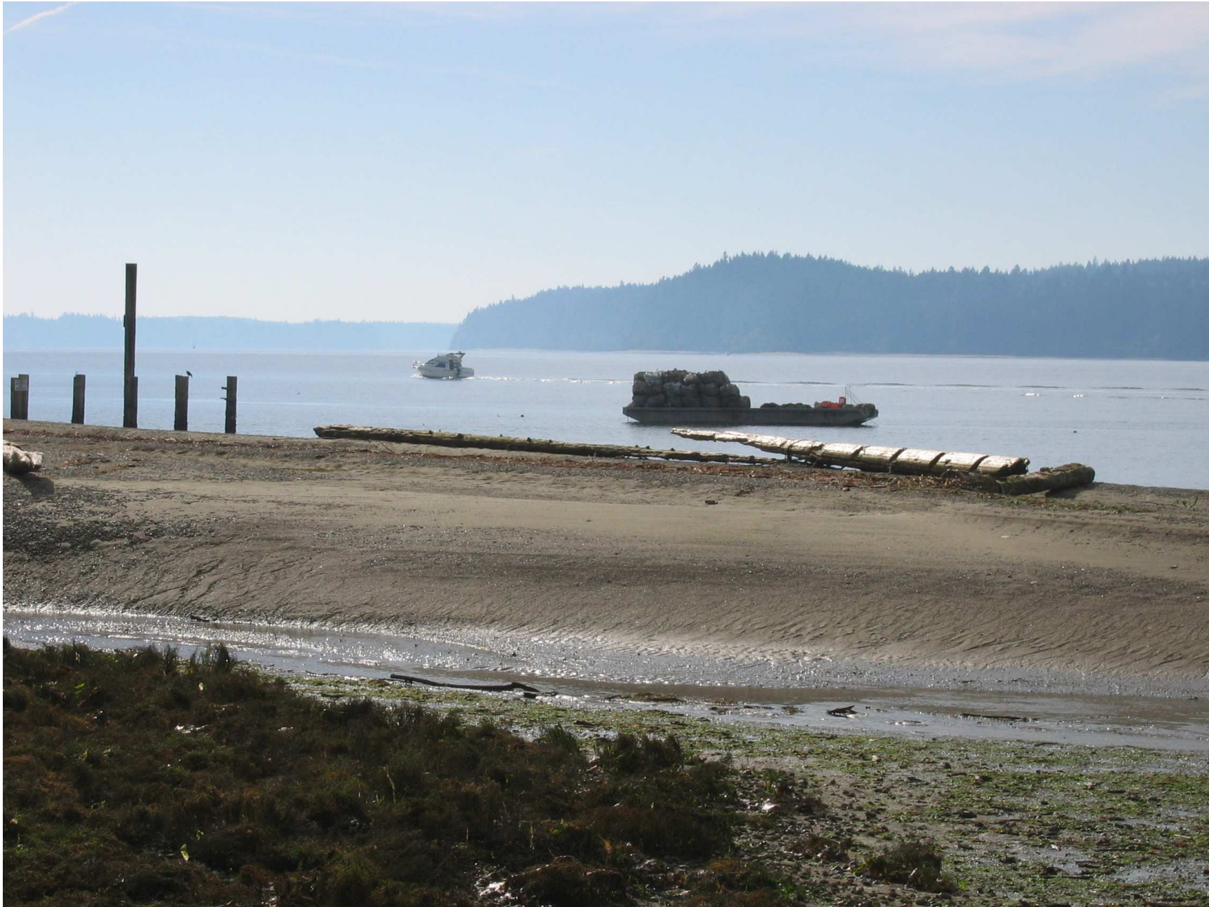
Taylor Foss operation, barge for new planting, 10/28/07