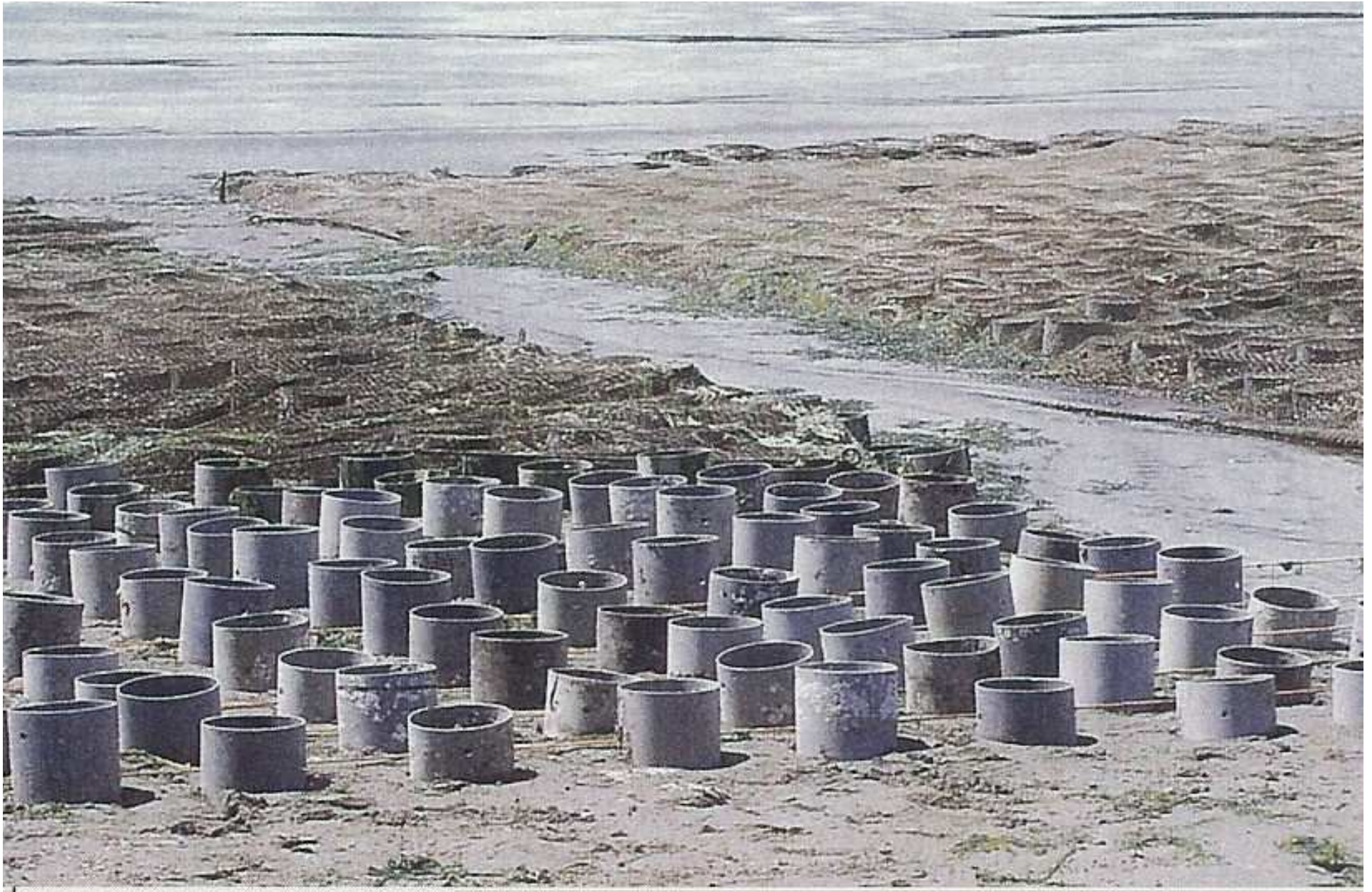
New planting on Foss farm, 7/3/07