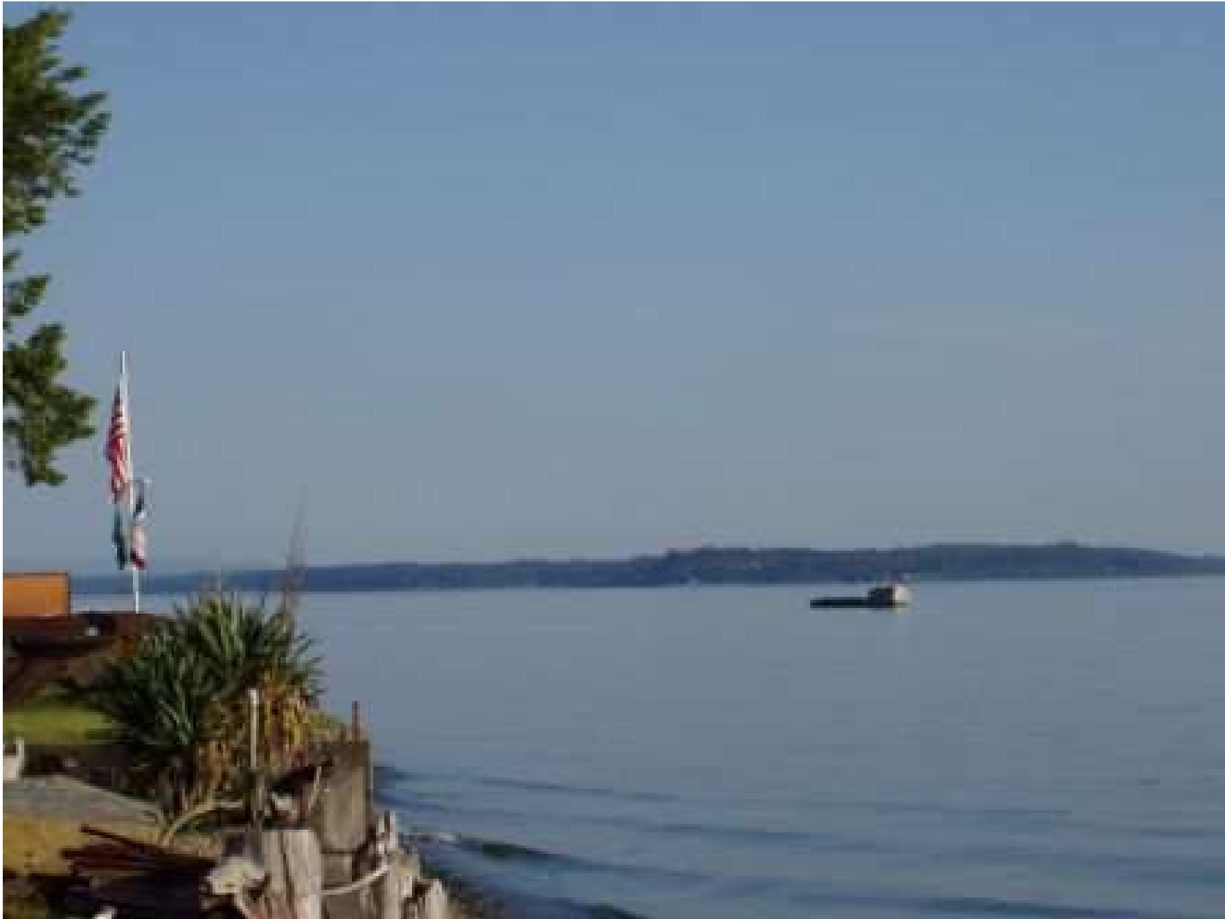
Taylor Foss geoduck operation – barge still there June, 2007