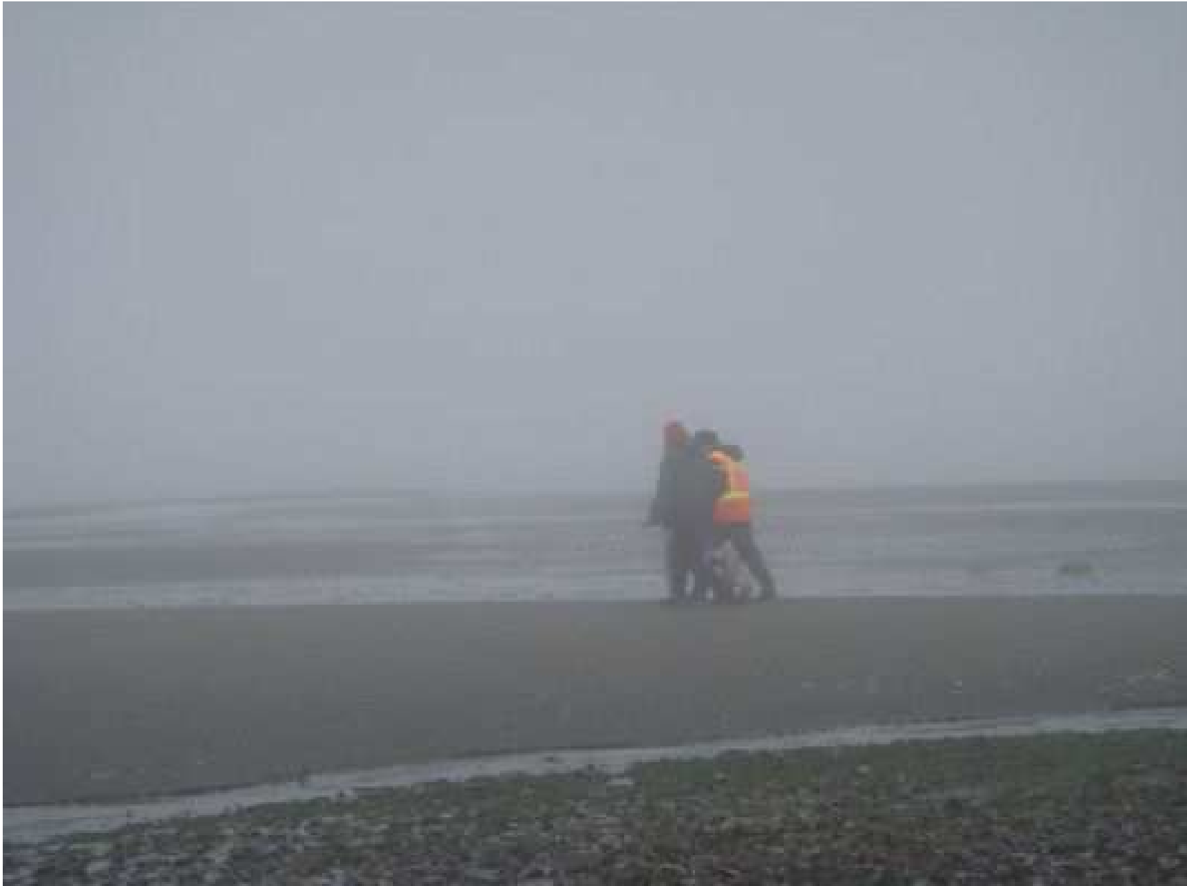
Taylor Foss geoduck operation – workers carrying off debris, 10/23/07