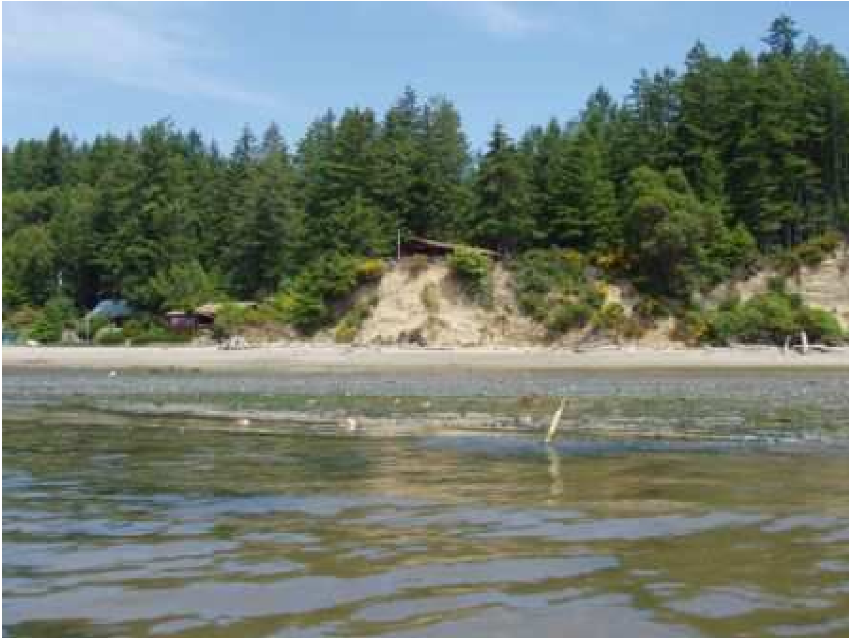
Taylor Foss geoduck operation, harvest area, 7/30/07