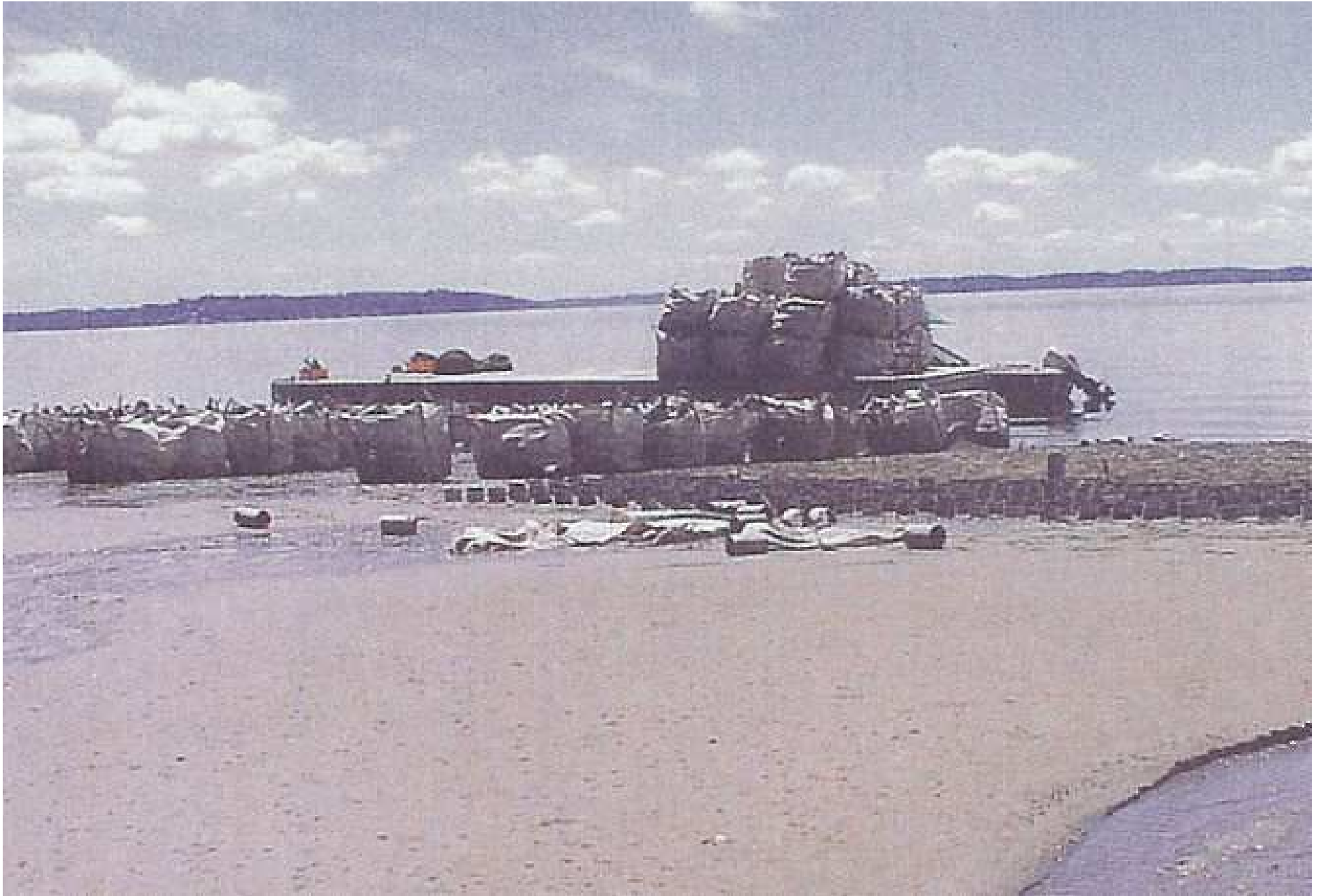
New planting on Foss farm, 7/3/07