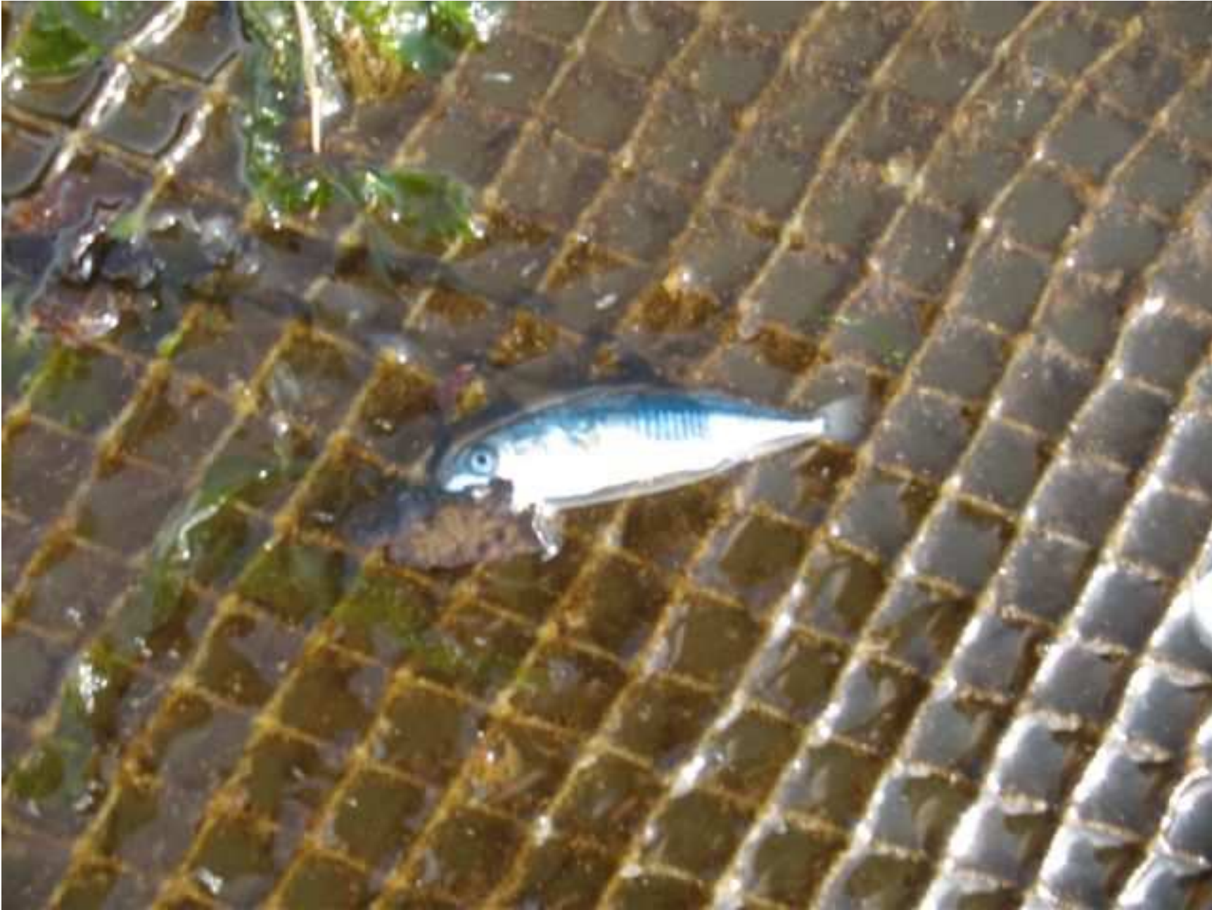
Taylor Foss operation - dead fish left in net after tube removal, 6/11/07