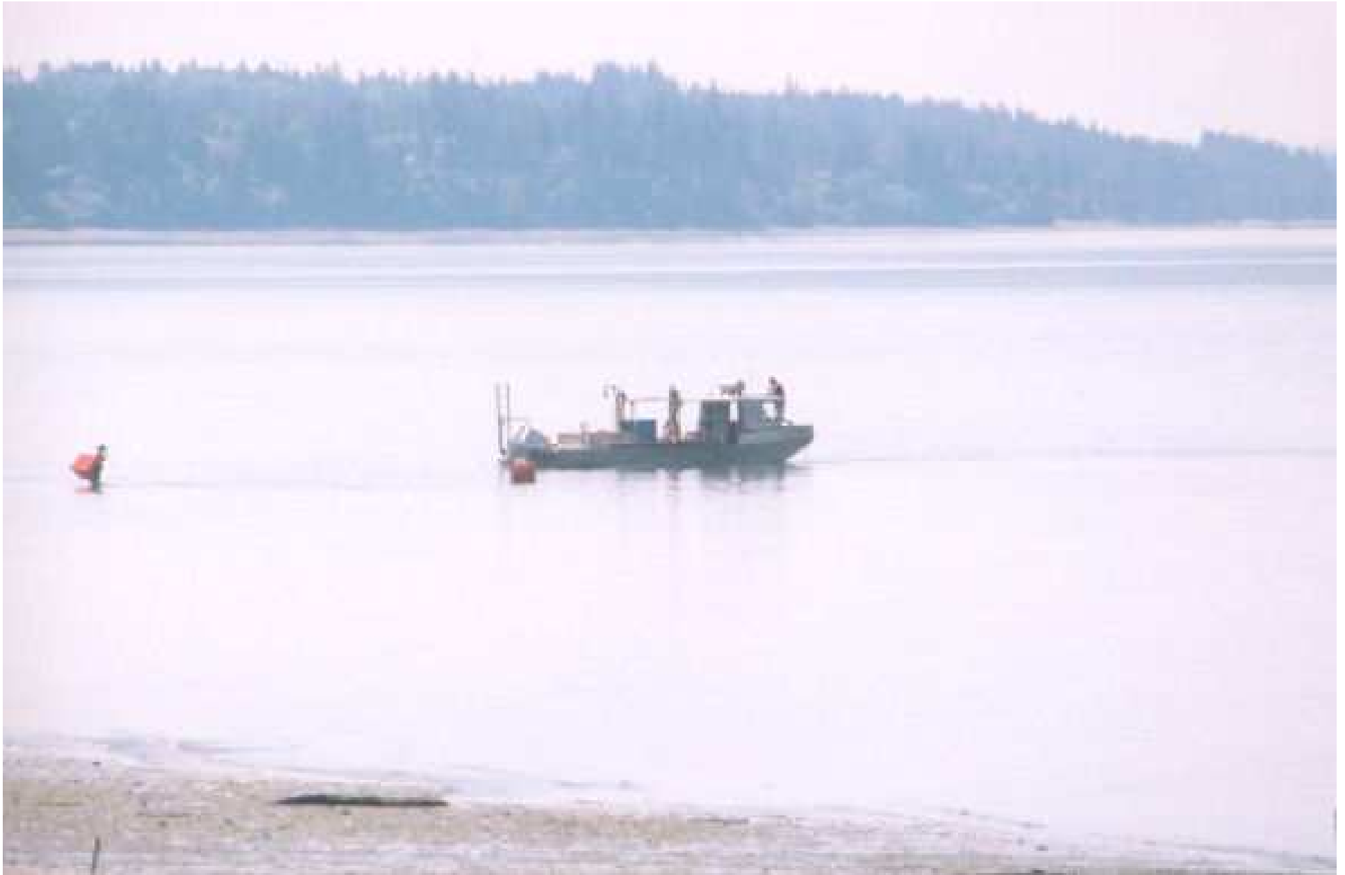
Taylor Foss geoduck operation – unloading crates for harvest, 2007