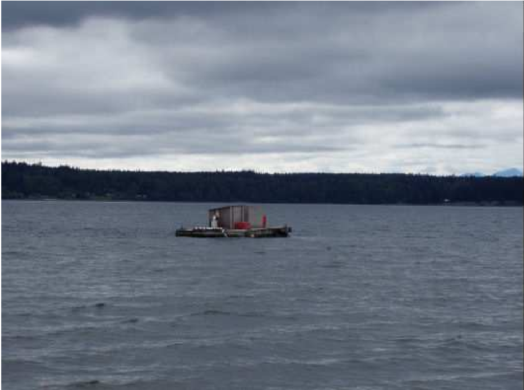
Taylor Foss operation, barge with harvest pump, 5/07