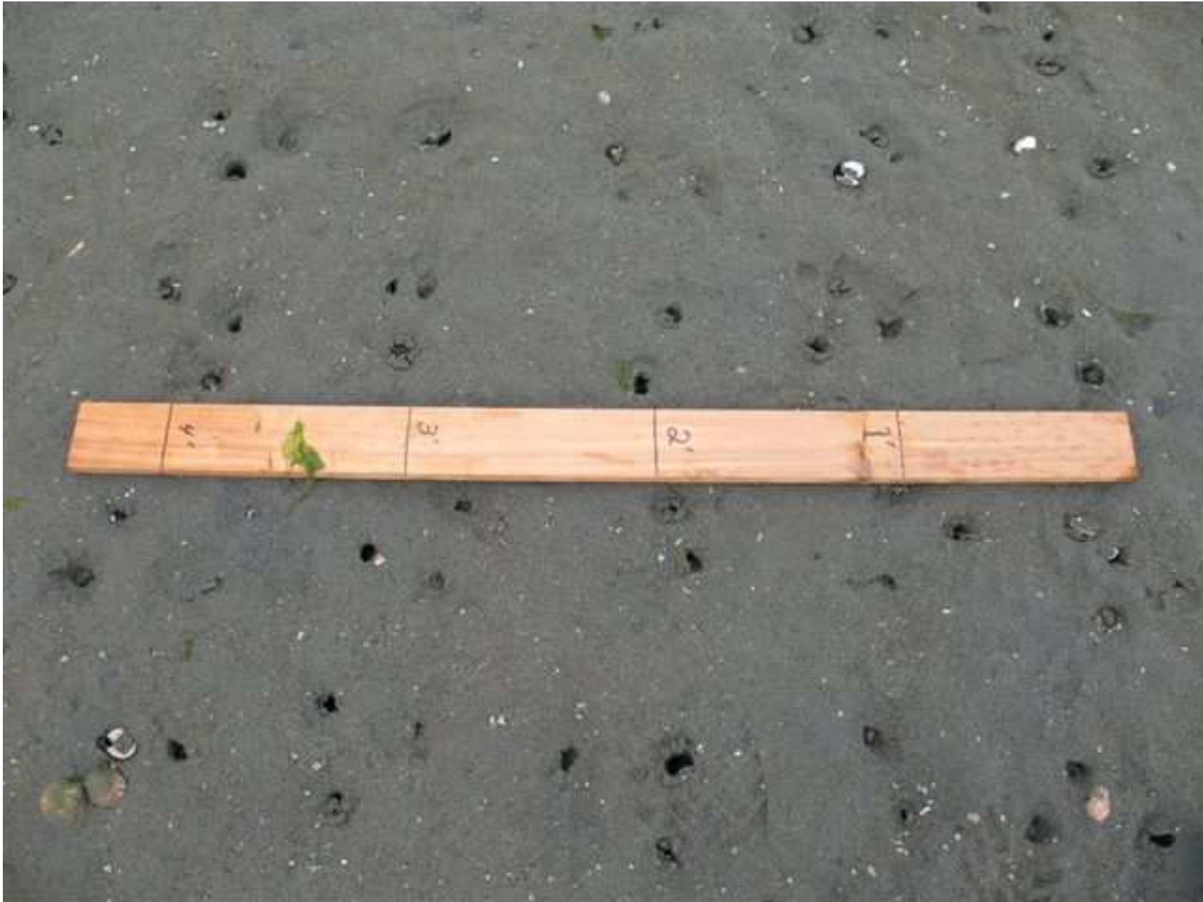
Taylor Foss operation, density of geoducks per square foot, 6/11/07