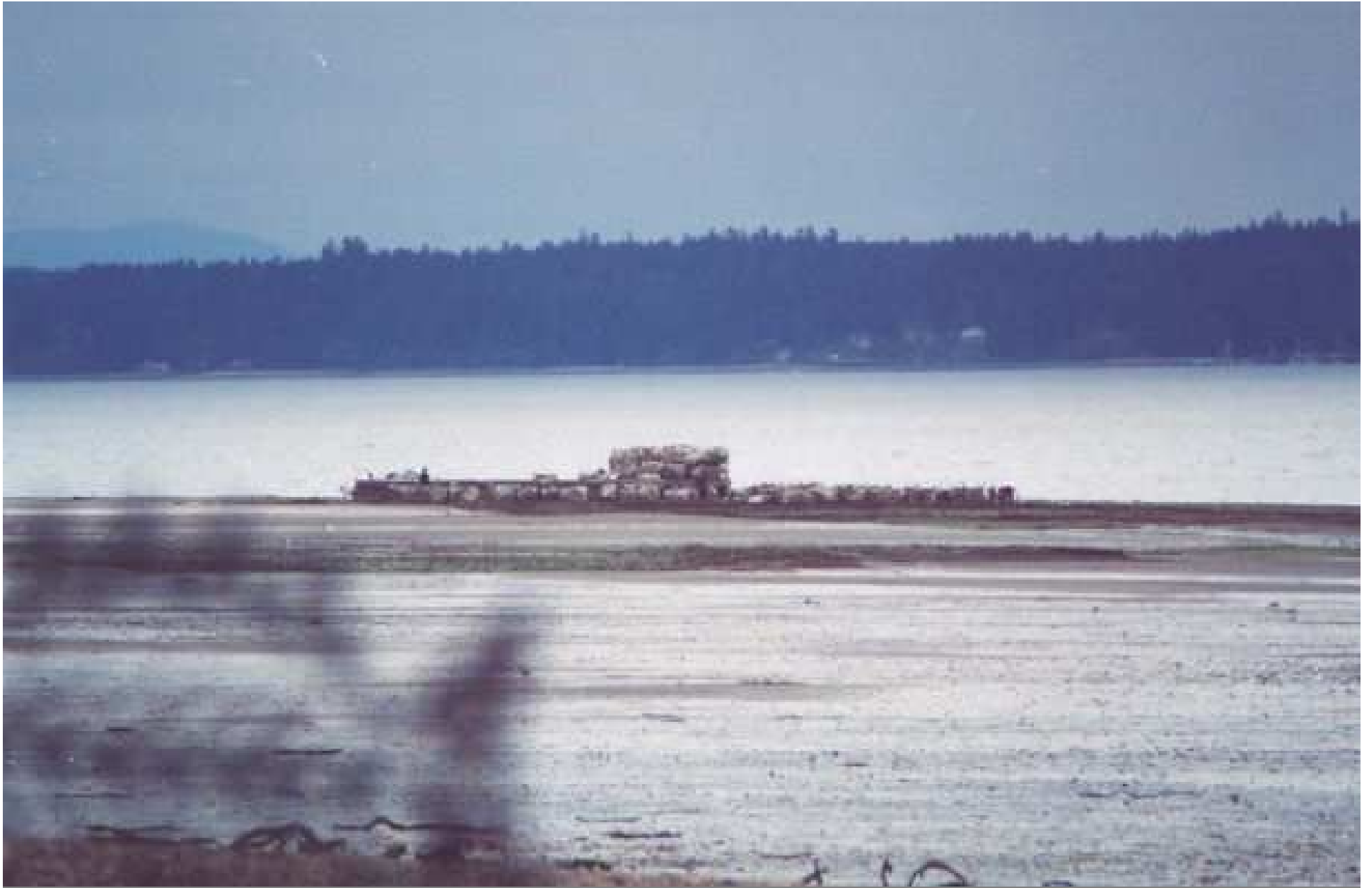
Taylor Foss geoduck operation – tube barge, May, 2007