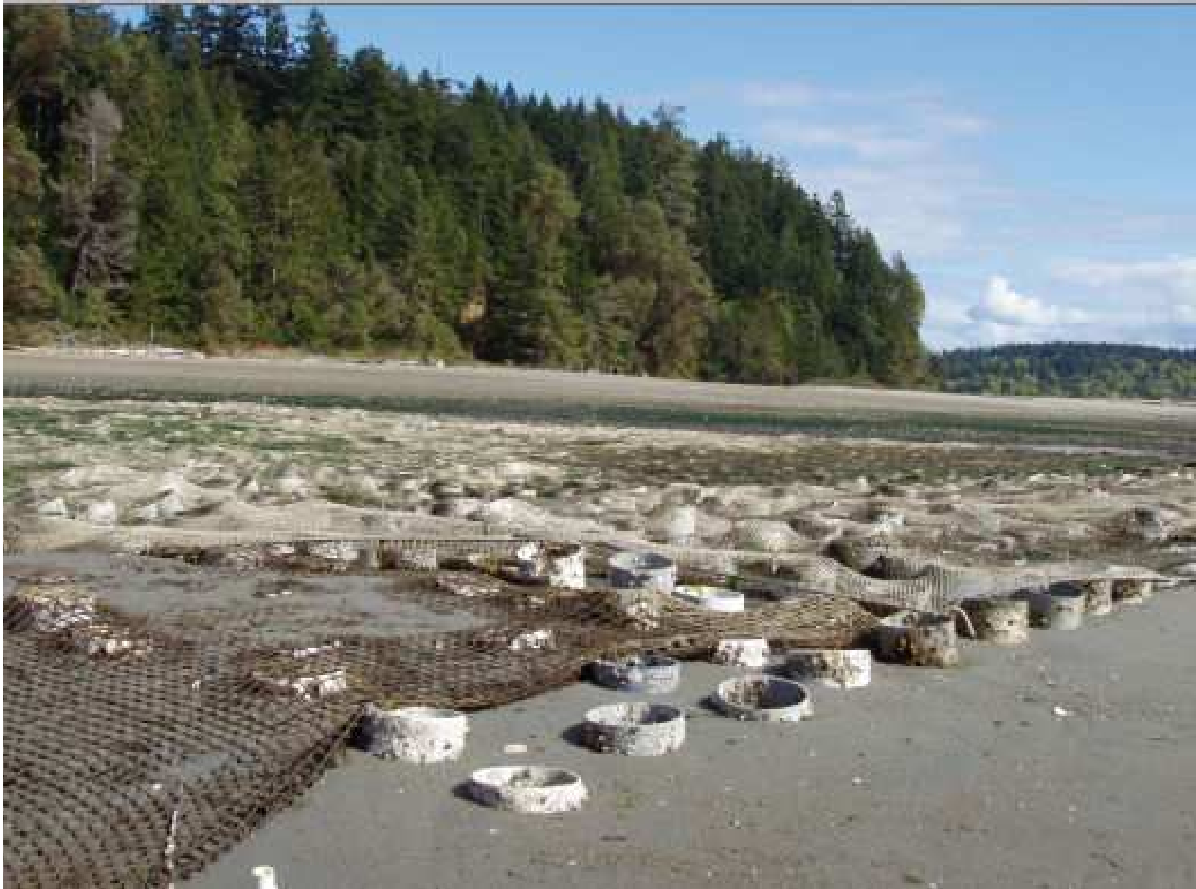
Cargo nets and tubes - Foss farm, 4/22/07