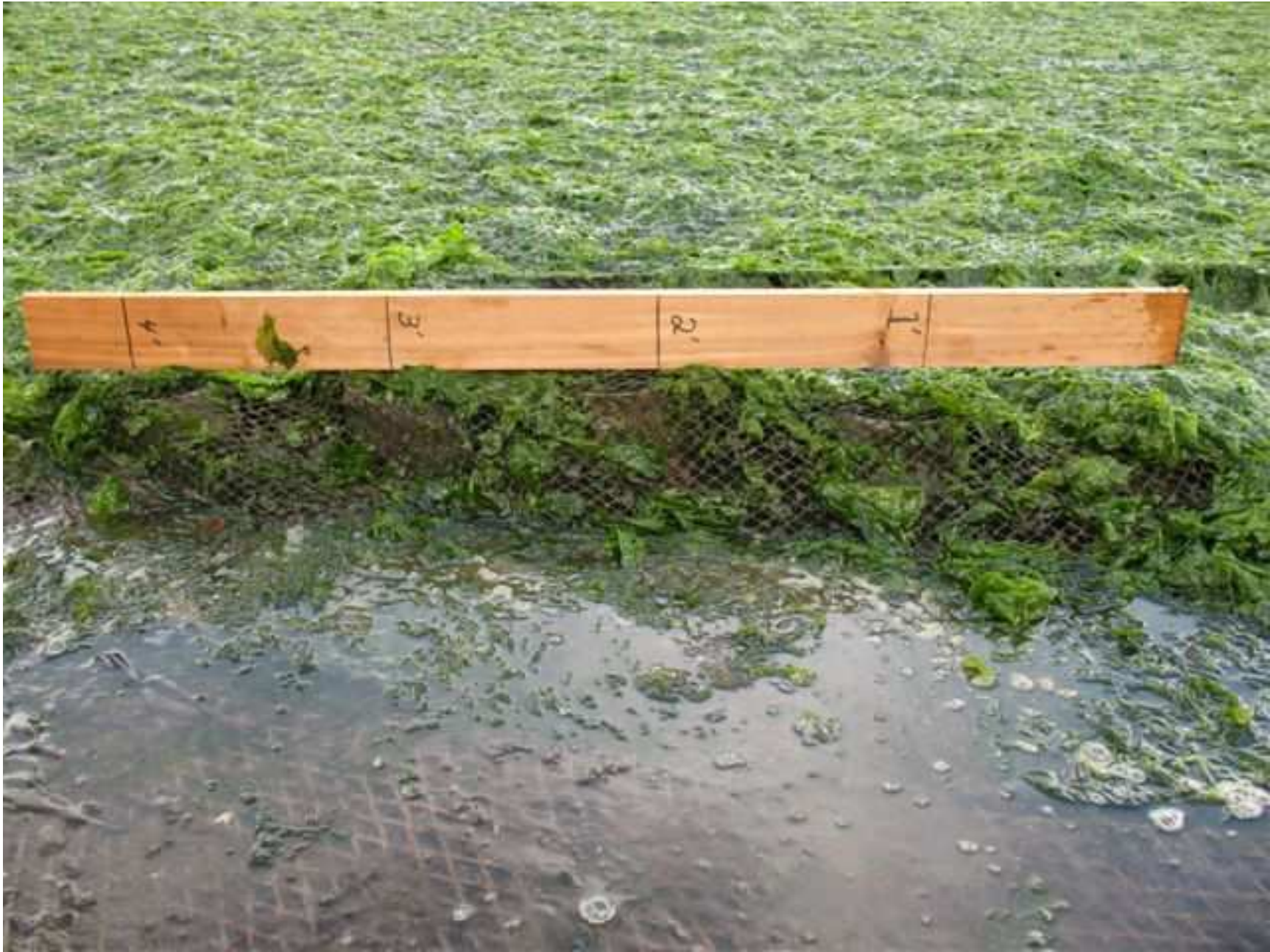
Taylor Foss operation, netting covered with algae, 6/11/07