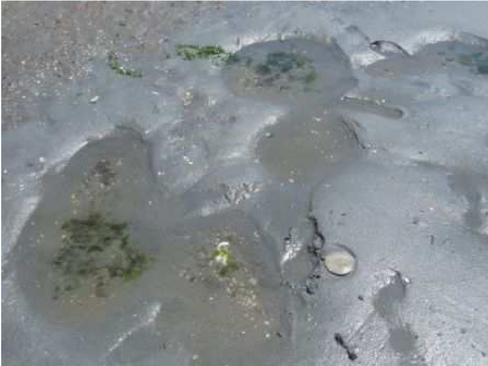
Beach after Taylor Shellfish geoduck harvest, Foss operation, 6/2/07