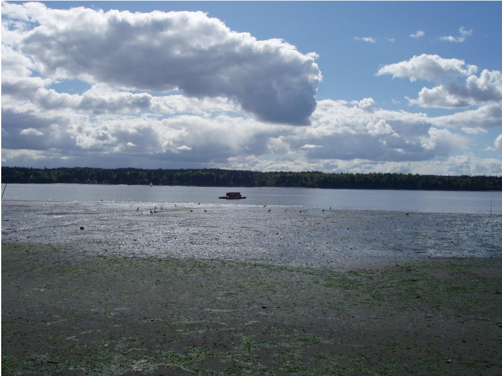
Taylor Shellfish Foss operation barge 4/22/07