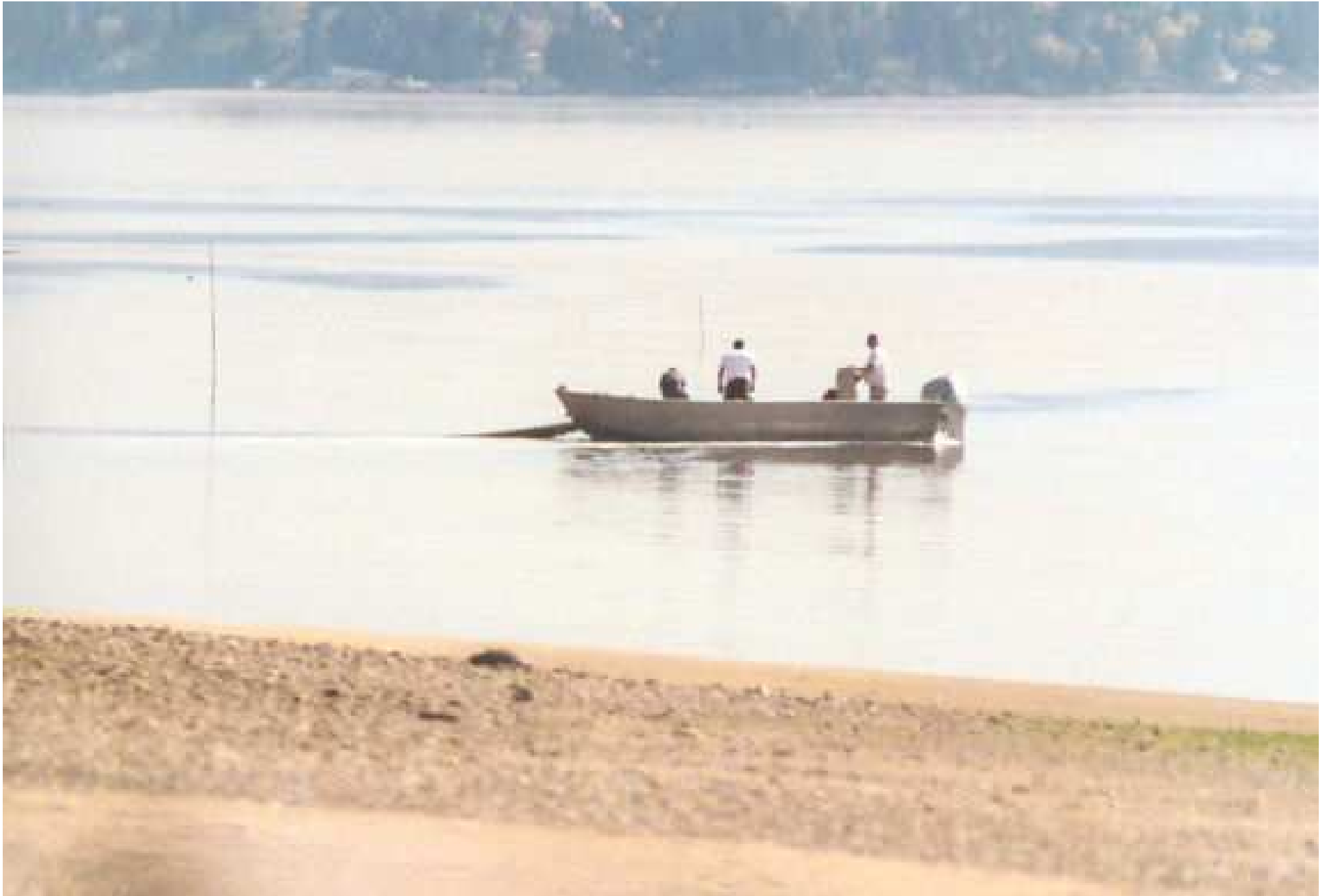
Taylor Foss geoduck operation – dragging nets, April 2007