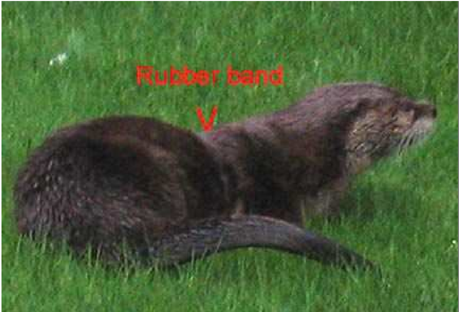
Otter with a rubber band around its waist near geoduck farm. Citizens unable to help – Case Inlet, 2/3/06