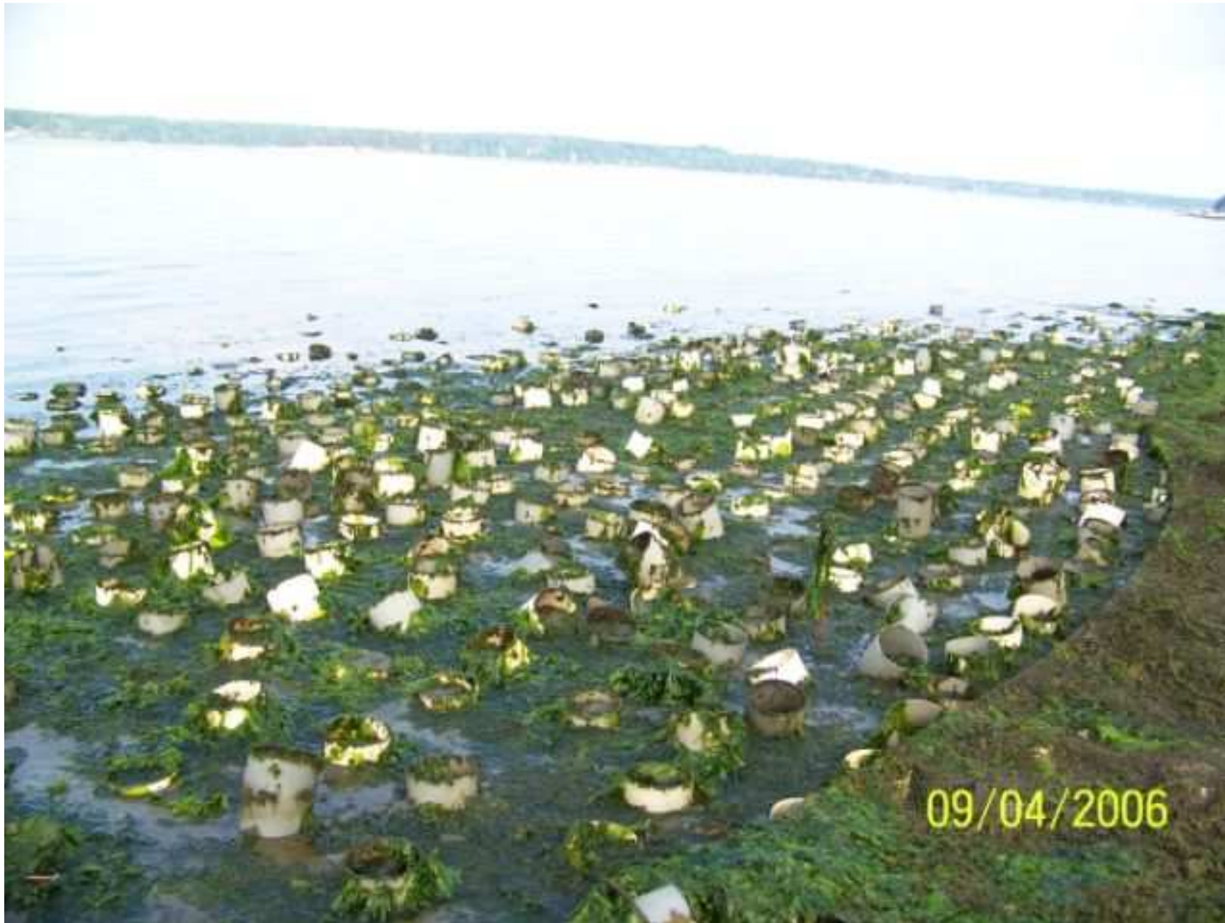
Accumulation of macro algae on Taylor Foss operation.