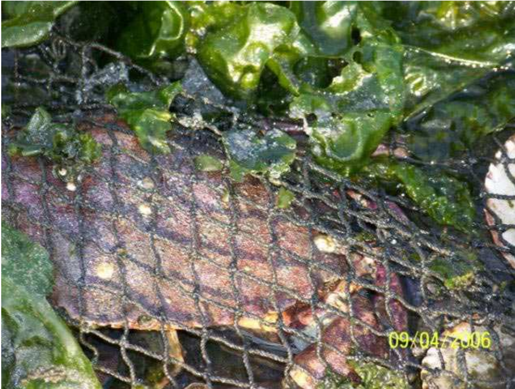
Taylor Foss geoduck operation, crab caught under predator exclusion netting, 9/4/06