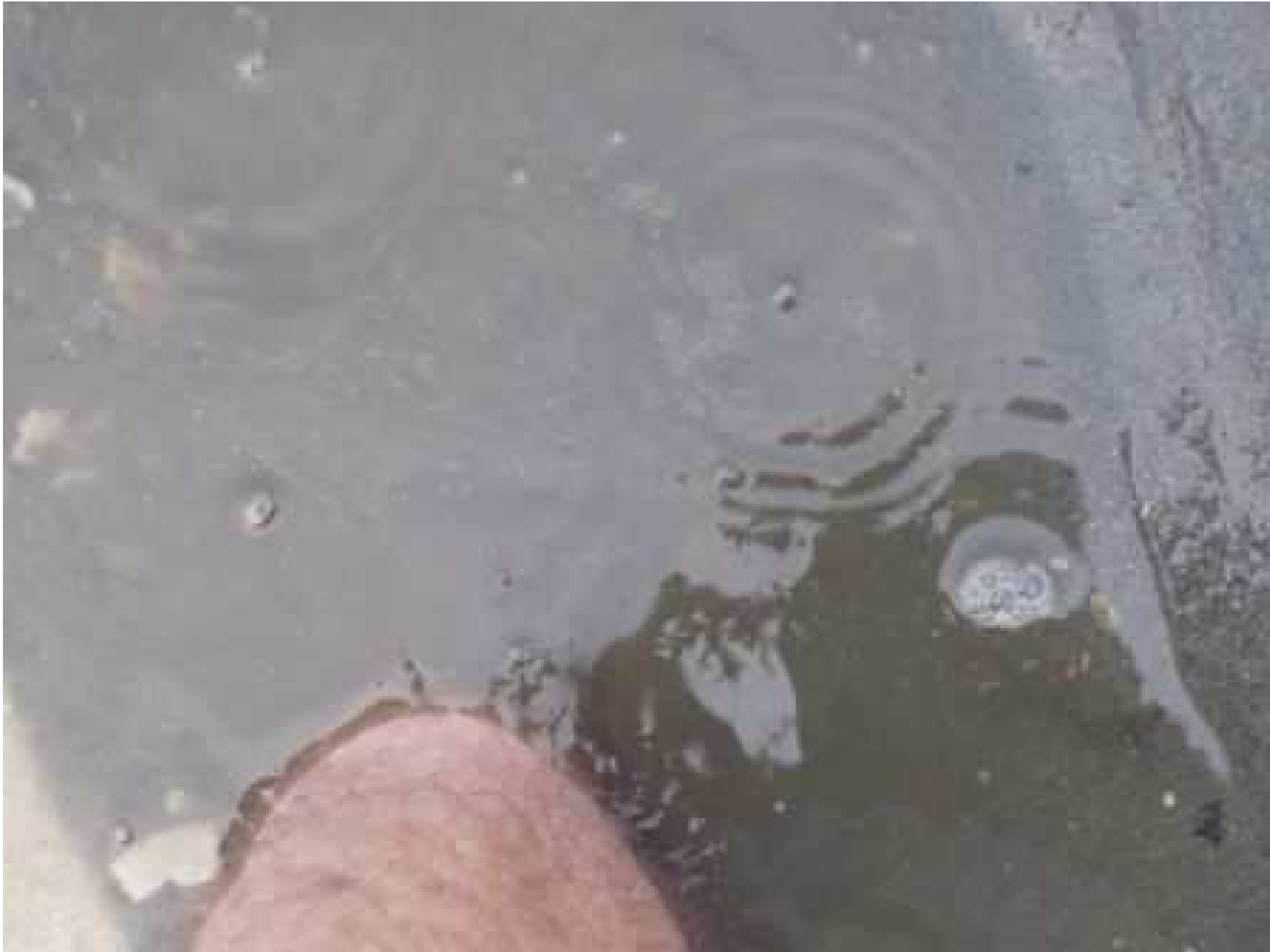
Foss farm, up to knees in muck, 6/2/07