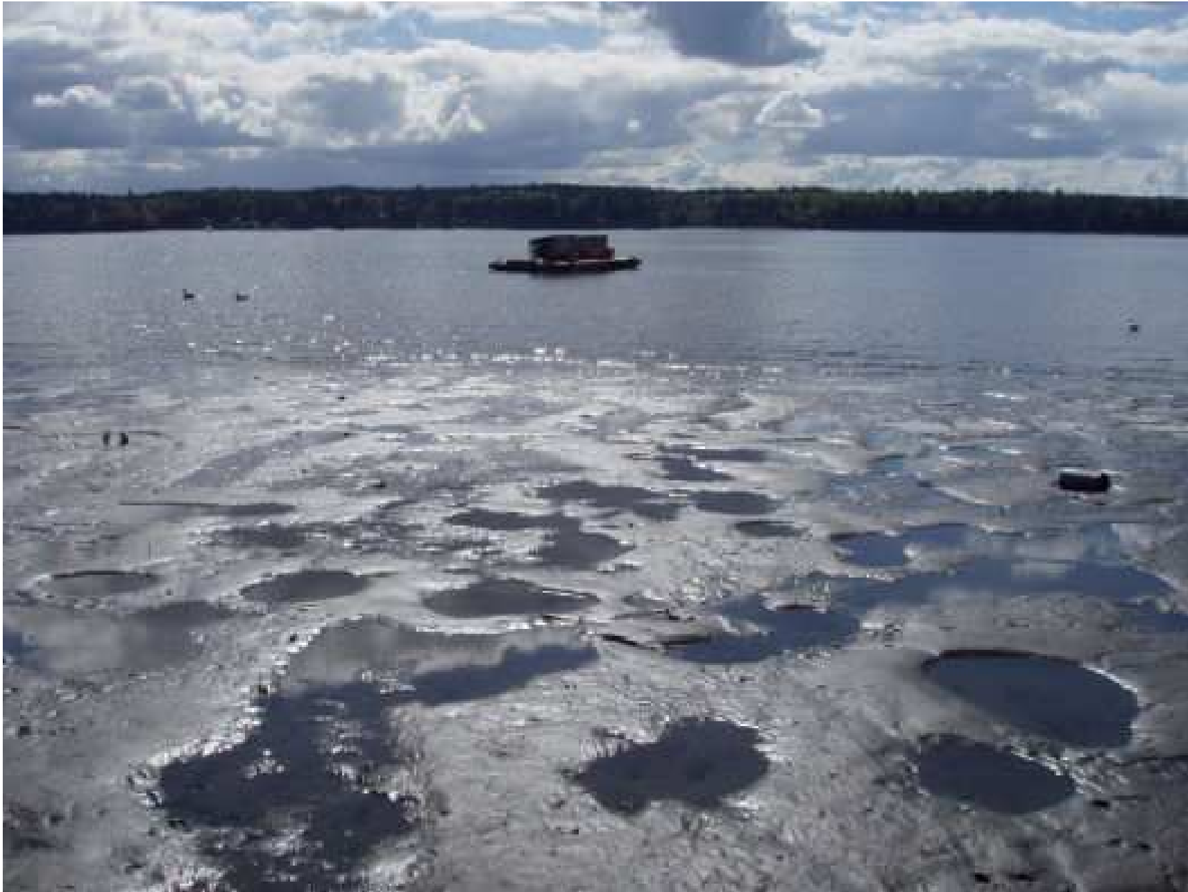
Beach two days after Taylor Shellfish harvest, Foss operation, tube abandoned on beach. 4/22/07