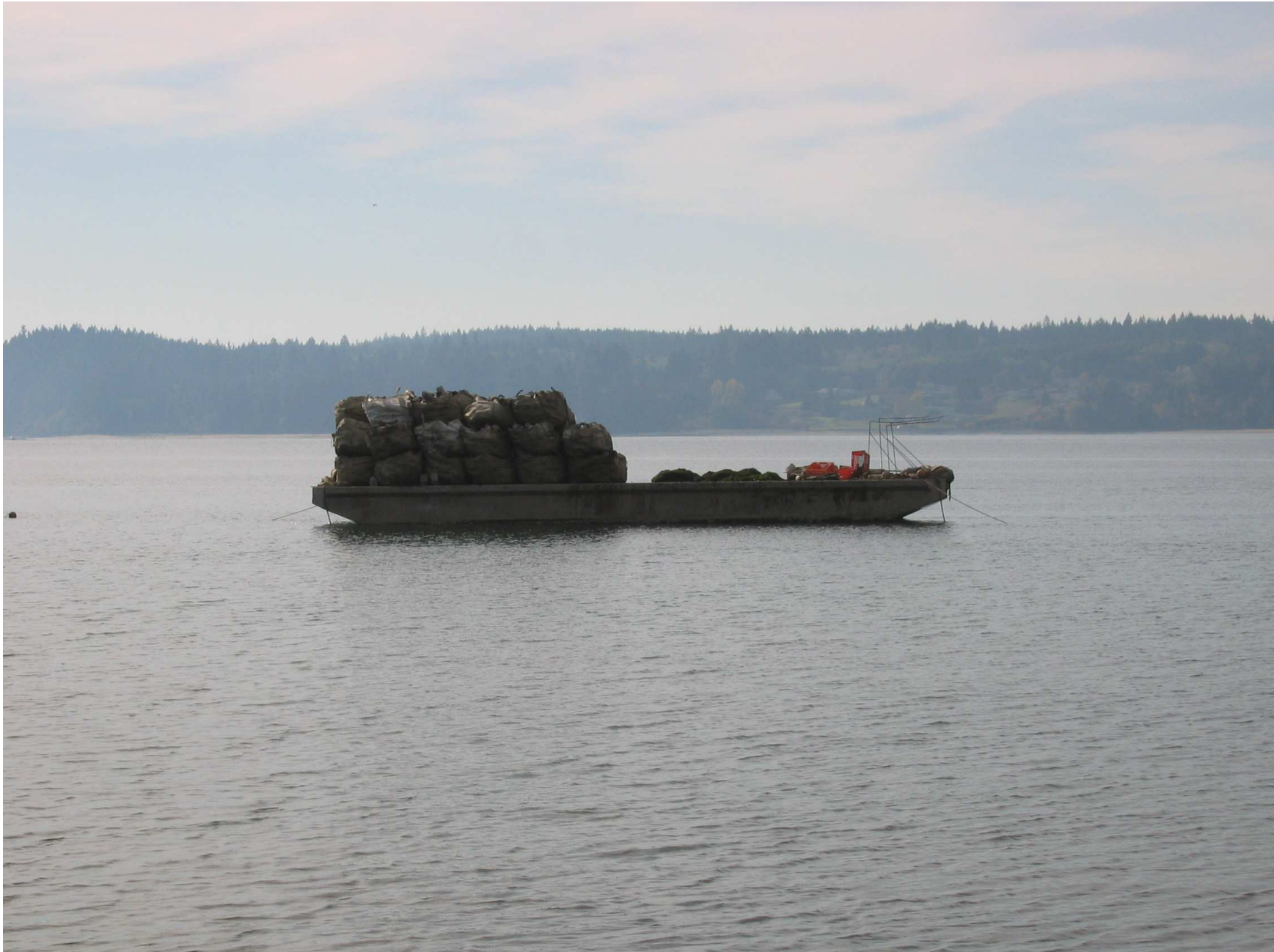
Taylor Foss operation, barge for new planting, 10/28/07