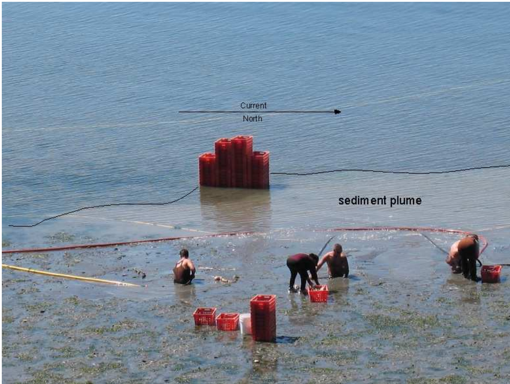
Taylor Foss operation water jet harvest, obvious sediment plume, northern edge of Foss property. 8/14/07