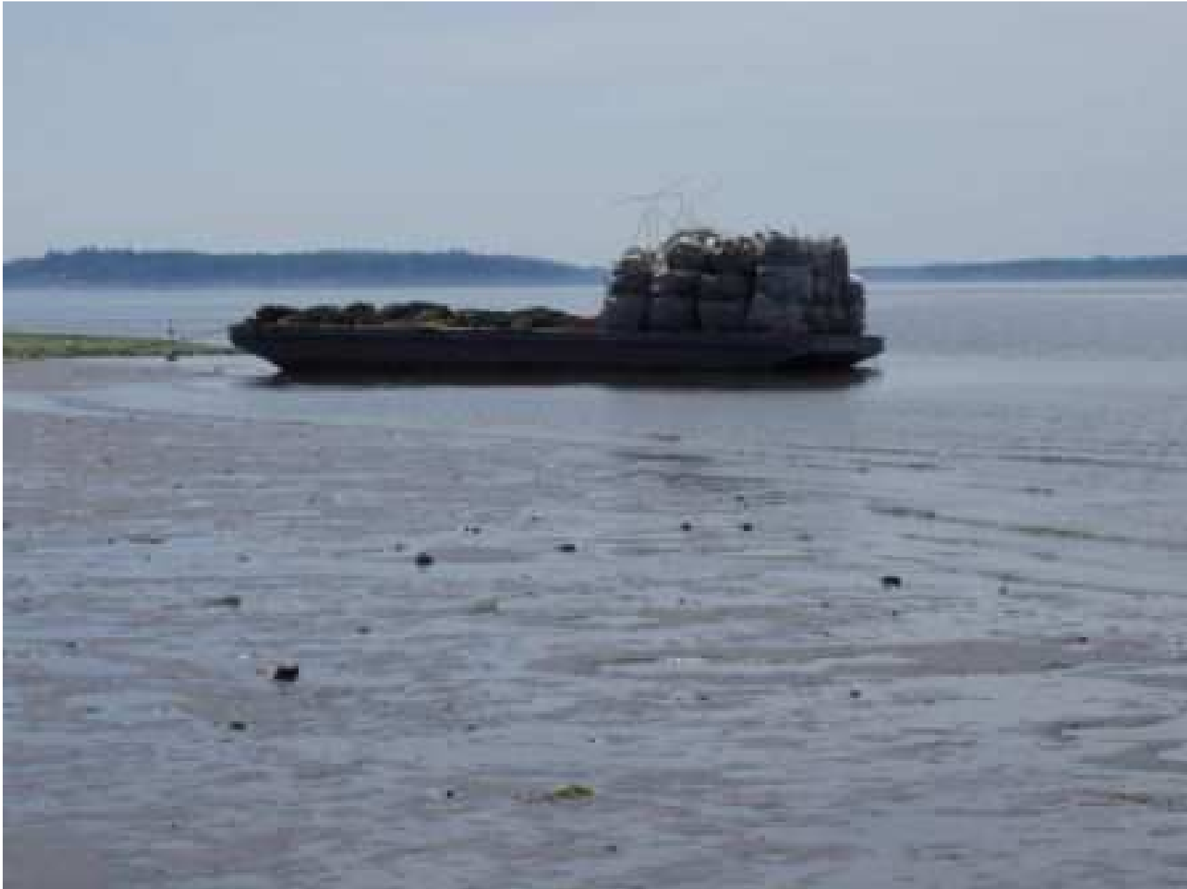
Taylor Shellfish geoduck barge on Foss Farm 6/2/07