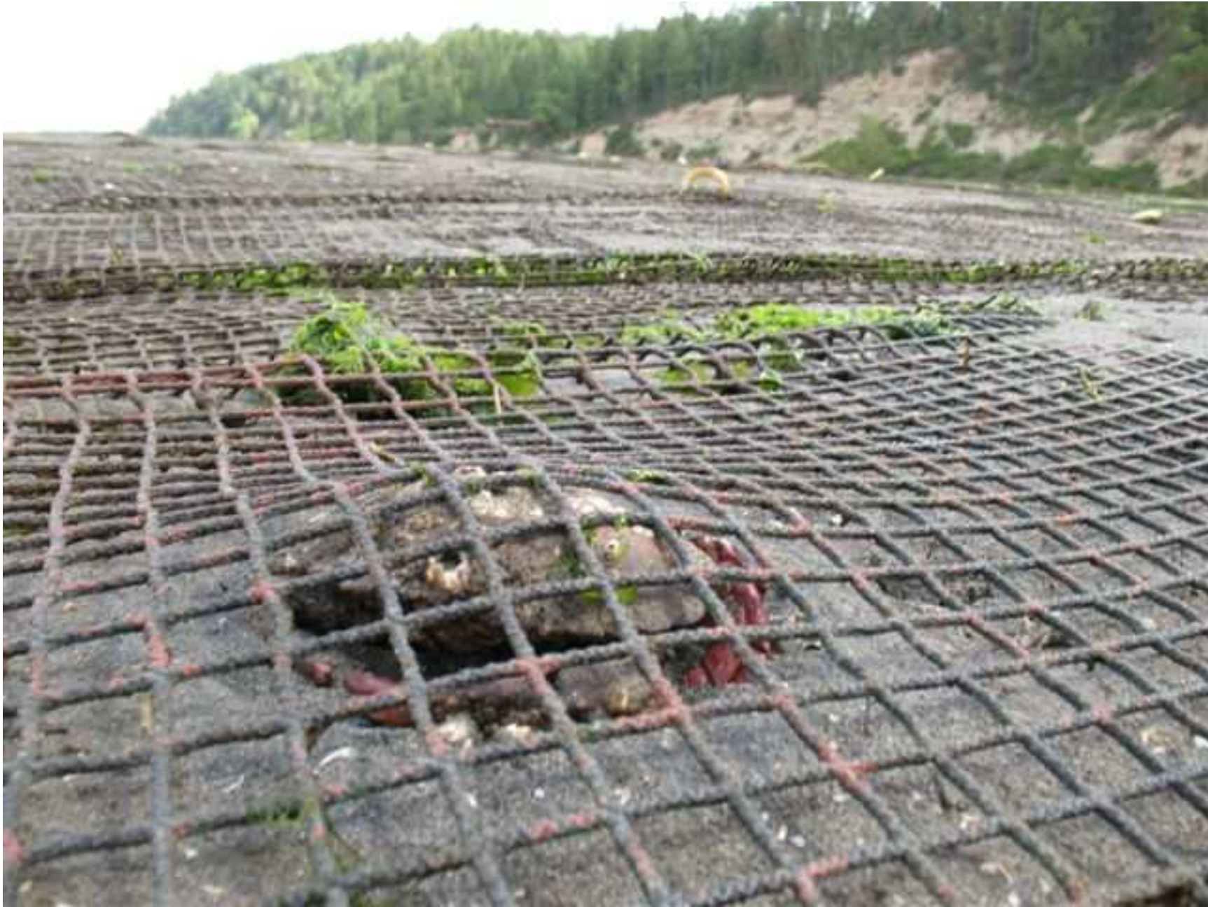
Taylor Foss operation, net traps crab, 6/11/07