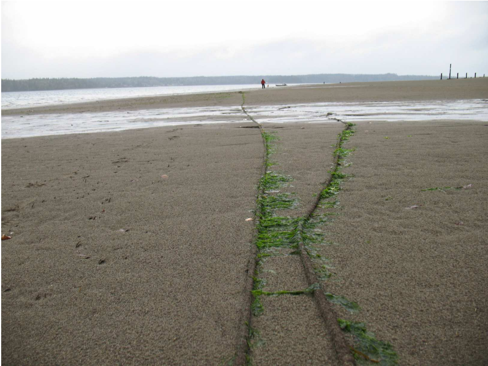
Taylor Foss operation, anchored ropes along the beach, 3/07