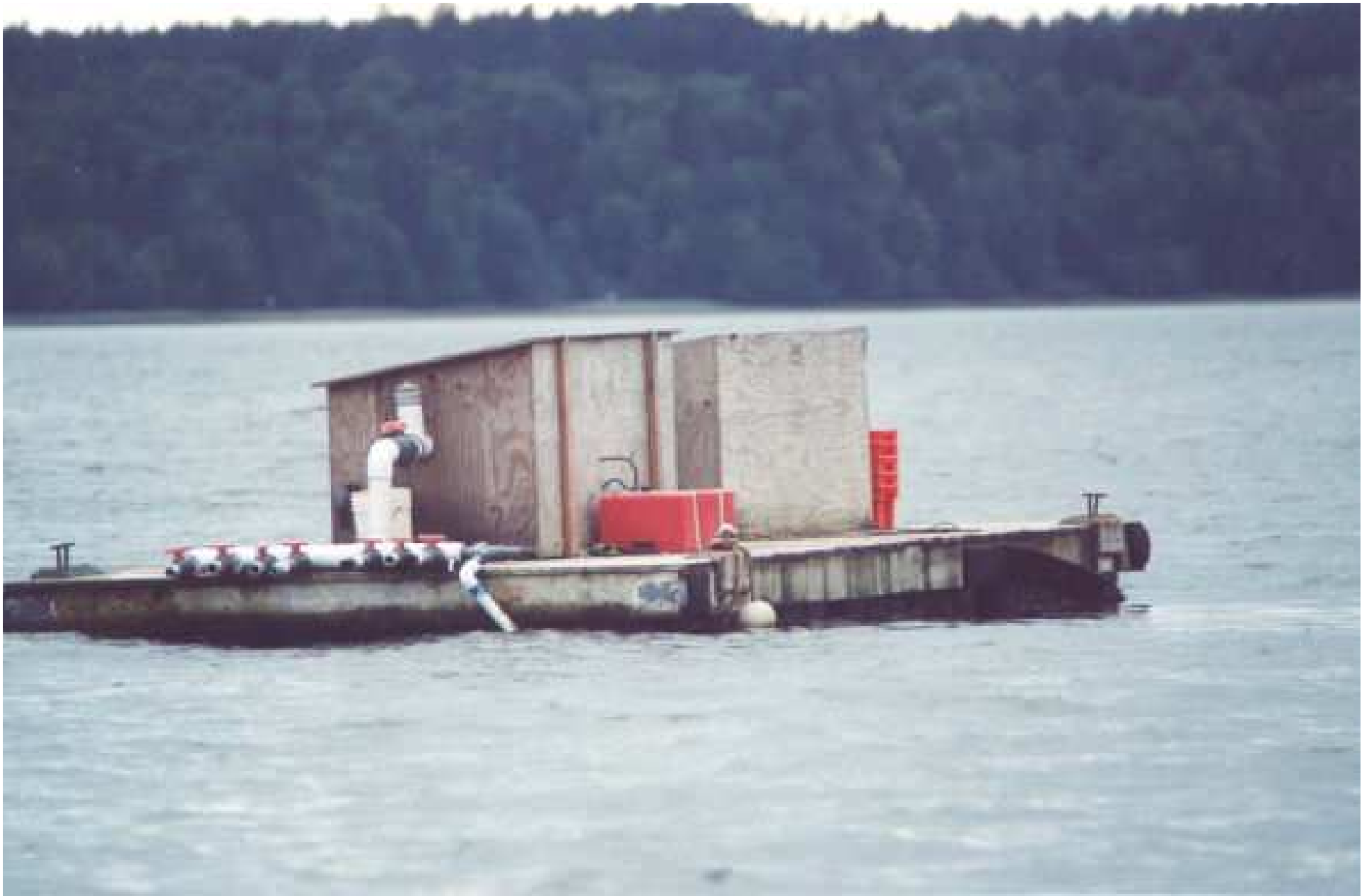
Taylor Foss geoduck operation –harvest pump barge, May, 2007