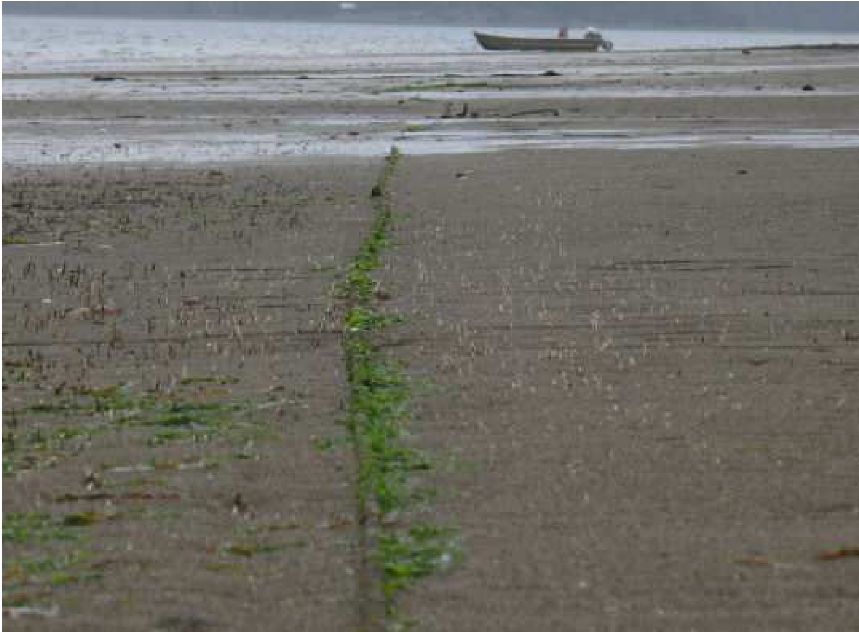
Taylor Shellfish Foss operation, anchor rope, 3/07